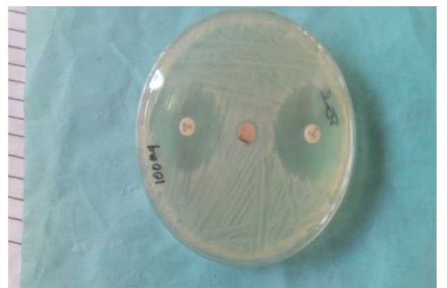
Plate 5: 100mg/dl disc of Uvaria charmae extract as compared with equal concentration of ciprofloxacin and levofloxacin.