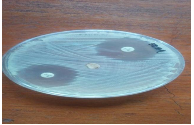
Plate 4: 50mg/dl disc of Uvaria charmae extract as compared with equal concentration of ciprofloxacin and levofloxacin.