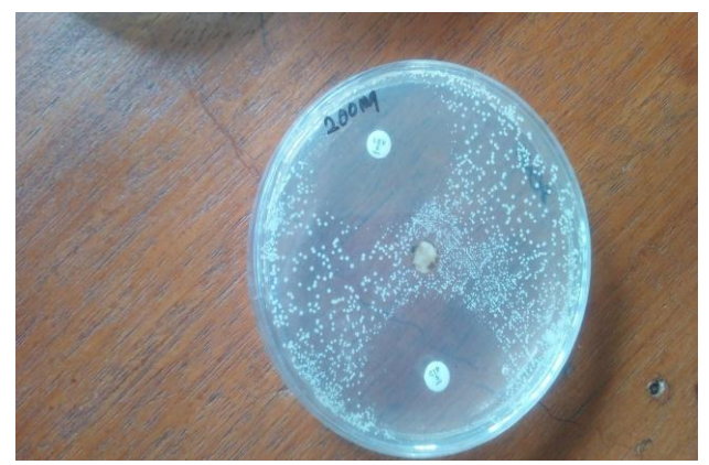
Plate 6: 200mg/dl disc of Uvaria charmae extract as compared with equal concentration of ciprofloxacin and levofloxacin.

At concentrations of 25mg/dl, 50mg/dl, 100mg/dl and 200mg/dl, Ciprofloxacin and levofloxacin showed zones of inhibition of S. aureus greater than 21mm which depicted sensitivity according to published interpretation chart, but the Uvaria charmae extracts under study did not show any zone of inhibition of the bacterial organism at similar concentrations and was thus regarded as non-sensitive.