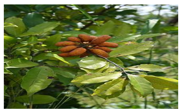
Plate 1: Uvaria charmae plant.

Stock solution of Uvaria charmae extract was prepared by dissolving 55.9 mg/g body weight in 20ml of Dimethyl Sulphoxide (DMSO) diluted in 20ml of distilled water. Discs of different concentration strengths (25mg/dl, 50mg/dl, 100mg/dl, 200mg/dl) were prepared from the stock solution, dried and stored in the refrigerator at 4<sup>o</sup>C until required.