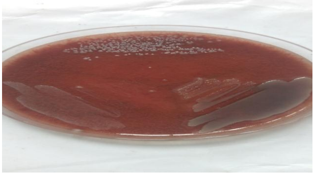
Plate 2: Luxuriant growth of Staphylococcus aureus ATCC 25923 on blood agar plate.

A standard strain, Staphylococcus aureus ATCC 25923 was obtained from the Nigerian Institute of Medical Research (NIMR), Lagos, Nigeria. This was first subcultured on blood agar and then used for antimicrobial susceptibility testing to determine the antibacterial activity of Uvaria charmae extract on Mueller-Hinton agar plates.