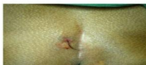
Figure 1: Pilonidal sinus with associate hairs