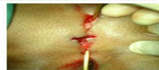
Figure 5: probing and placing of threa