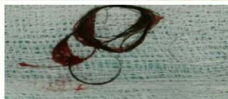
Figure 4: Bulk of hair expelled out