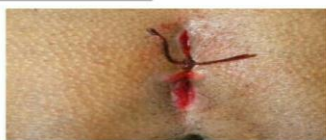
Figure 6: Placing of ksharasutra