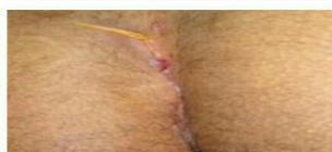
Figure 7: After 14 days