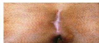
Figure 8: After 40 days complete heali