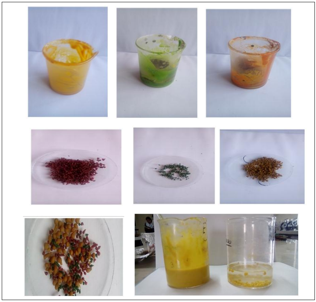
Fig No. 1: Polyherbal biodegradable micro beads (By using three colour agent).