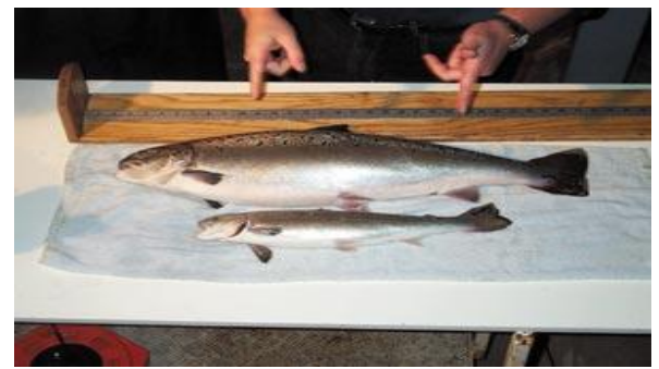
Transgenic Salmon and Normal Salmon

A genetically modified Atlantic salmon known as the Aqu Advantage salmon has an increased growth rate and size over the wild type Atlantic salmon from which it was derived, up to doubling its weight with a reduced time of growth to maturity.