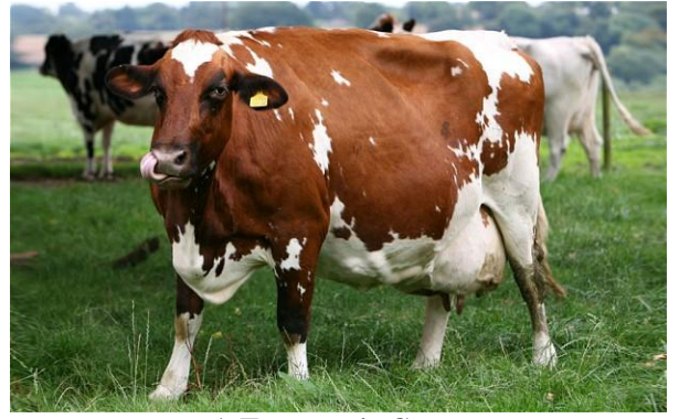
A Transgenic Cow

First, the gene for the desired product is identified and sequenced. Then a gene construct containing this desired gene is created using DNA cloning, restriction enzyme digests and ligation. The gene construct is then introduced into female bovine (cow) cells by transfection. Transgenic bovine cells are selected and fused with bovine oocytes that have had all of their chromosomes removed. Once fused with the oocyte, the transgenic cell's chromosomes are reprogrammed to direct development into an embryo, which can be implanted into a recipient cow. After a 9-month gestation period, a female calf is born. She will only express the transgene in her milk during lactation after her first calf is born. This is because expression of the transgene is controlled by a promoter specific to lactating mammary cells lactating mammary cells.