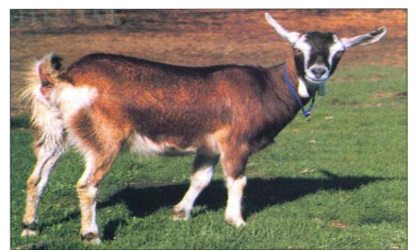
A Transgenic Goat

Transgenic goats were successfully produced during 1990s by groups headed by John McPherson and Karl Ebert both in USA. These transgenic goats expressed a heterologous protein (a variant of human tissue-type plasminogen activator = LAtPA) in their milk. This protein is used for dissolving blood clots i.e. for treatment of coronary thrombosis. A CDNA representing LAtPA was linked with either the murine whey acid promoter (WAP) or a \beta case in promoter in an expression vector and used for injecting early embryos obtained surgically from the oviducts of super ovulated dairy goats. These injected embryos were either immediately transferred to the oviducts of recipient females (surrogate mothers) or cultured for 72 hours before transferring to the uterus of recipient females. Of 29 off-springs from 36 recipients, one male and one female contained the transgene. The transgenic female delivers 5 off-springs, one of which was transgenic showing expression of LAtPA at a low level of few milligrams per litre of milk. In another case of transgenic goat, few grams of LAtPA per litre of milk could be obtained. At this concentration, the dairy goat may become an economically viable bioreactor for human pharmaceuticals.