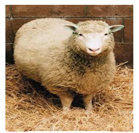
Transgenic Sheep - Dolly

Dolly was born on 5 July 1996 and had three mothers (one provided the egg, another DNA and a third carried the cloned embryo to term). She was created using the technique of somatic cell nuclear transfer, where the cell nucleus from an adult cell is transferred into an unfertilised oocyte (developing egg cell) that has had its cell nucleus removed. The hybrid cell is then stimulated to divide by an electric shock, and when it develops into a blastocyst it is implanted in a surrogate mother. Dolly was the first clone produced from a cell taken from an adult mammal. The production of Dolly showed that nucleus genes in the of such а mature differentiated somatic cell are still capable of reverting to an embryonic totipotent state, creating a cell that can then go on to develop into any part of an animal. Dolly's existence was announced to the public on 22 February 1997. It gained much attention in the media. A commercial with Scottish scientists playing with sheep was aired on TV, and a special report in TIME Magazine featured Dolly the sheep. Science featured Dolly as the breakthrough of the year. Even though Dolly was not the first animal to be cloned, she gained this attention in the media because she was the first to be cloned from an adult cell.