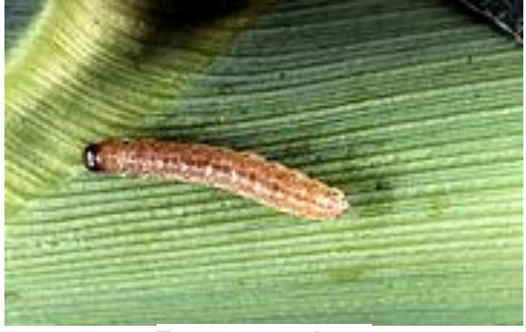
European corn borer

The Bt protein is expressed throughout the plant. When a vulnerable insect eats the Bt-containing plant, the protein is activated in its gut, which is alkaline (human guts are acidic). In the alkaline environment the protein partially unfolds and is cut by other proteins, forming a toxin that paralyzes the insect's digestive system and forms holes in the gut wall. The insect stops eating within a few hours and eventually starves. In 1996, the first GM maize producing a Bt Cry protein was approved, which killed the European corn borer and related species; subsequent Bt genes were introduced that killed the corn rootworm larvae.