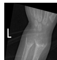
A. Wrist X. ray before Calcitriol.

X. ray show active rickets (A), which was resolved 3 months after calcitriol (B).