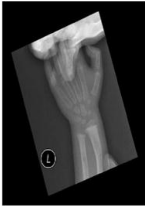
B. Wrist X. ray 3 months after Calcitriol.