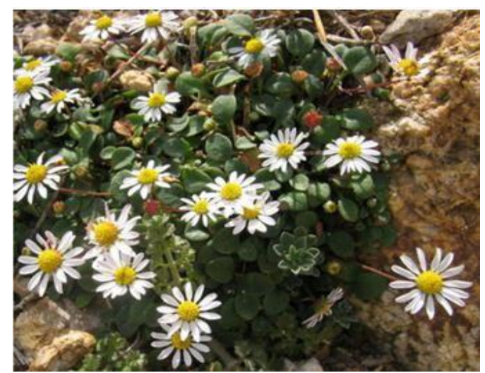
Figure 1- Bellium belidioides Aim of the Study.

The aim of this study was the isolation of Saonins from areal part of the plant Bellium bellidioedes , family Asteraceae.