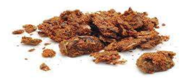
Fig. 1: Bee Propolis.

The bees use propolis to repair combs, to strengthen the thin borders of the comb, and to make the entrance of the hive weather tight or easier to defend (Fig.1). Propolis is also used as an "embalming" substance to cover the carcass of a hive invader which the bees have killed but cannot transport out of the hive.<sup>[7]</sup> The phytoconstituents composition in the bee propolis varies and depends upon the flora in the location. More than 500 compounds have been isolated and identified in bee propolis.<sup>[8]</sup> Uses of products containing propolis have resulted in extensive dermal contact and it is now increasingly being used a dietary supplement.