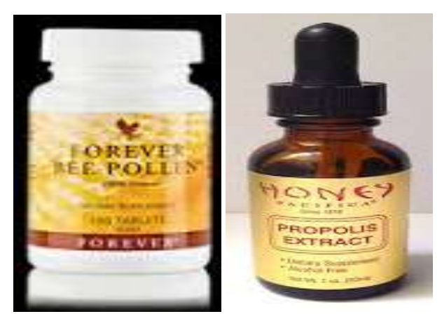
Fig. 3. Marketed tablets and drops formulations.

Ethyl cellulose micro particles containing propolis ethanolic extract (PE) were prepared by the emulsification and solvent evaporation method. Three ratios of ethyl cellulose to PE dry residue value (DR) were tested (1: 0.25, 1: 4, and 1: 10). Moreover, polysorbate 80 was used as emulsifier in the external phase (1.0 or 1.5% w/w).