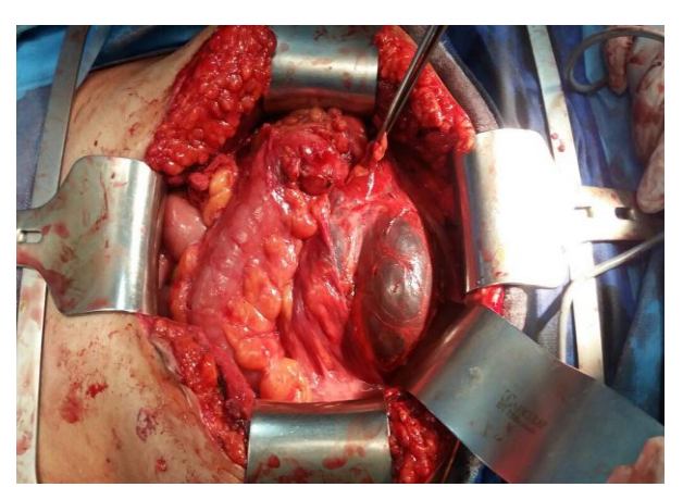
Figure. 1: Peroperative exploration revealed an enlarged cystic mass adherent to the mesosigmoid.

treatment. Other treatment modalities have also been described including aspiration and injection of sclerosant agents; however, these approaches are not recommended for elective therapy due to the high recurrence rates.<sup>[7]</sup>