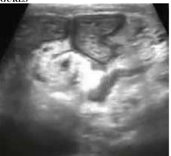
Fig. 1: Ultrasonographic image of right inguinal region reveals herniated bowel loops and mesentry within the herniated sac extending from inguinal canal to scrotum.