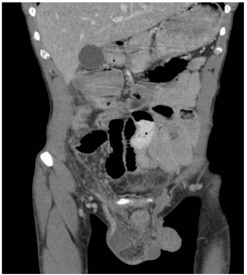
Fig. 5: Coronal CT image showing right inguinoscrotal hernia with intra-hernial mesenteric fat stranding also involving region of right spermatic cord along with intra scrotal fluid collection.