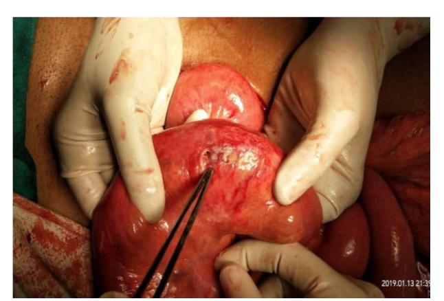
Fig. 4: Operative image reveals distal ileal perforation later repaired by ileo- ileal anastomosis.