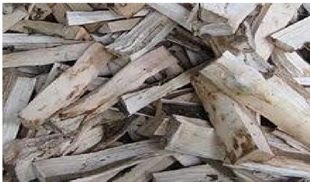
2. Agaru Kaphaghna dravya.

Chandan is kandughna, kaphaghna dravya. It reduces itching and burning sensation.