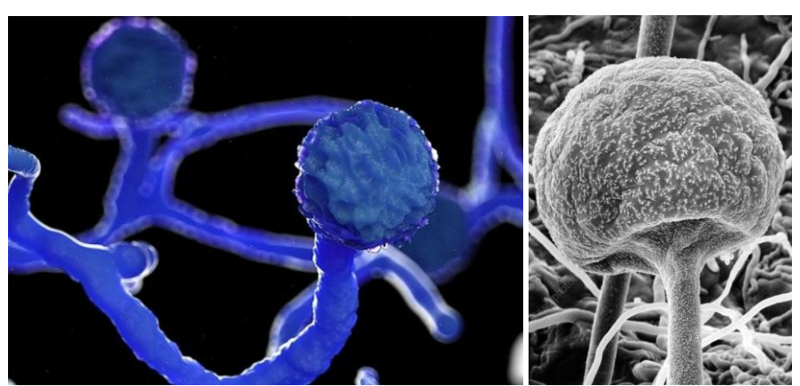
Figure-3: SEM of hyphae of mucor/fungus.

Gastrointestinal mucormycosis is more common among young children than adults, especially premature and low birth weight infants less than 1 month of age, who have had antibiotics, surgery, or medications that lower the body's ability to fight germs and sickness.