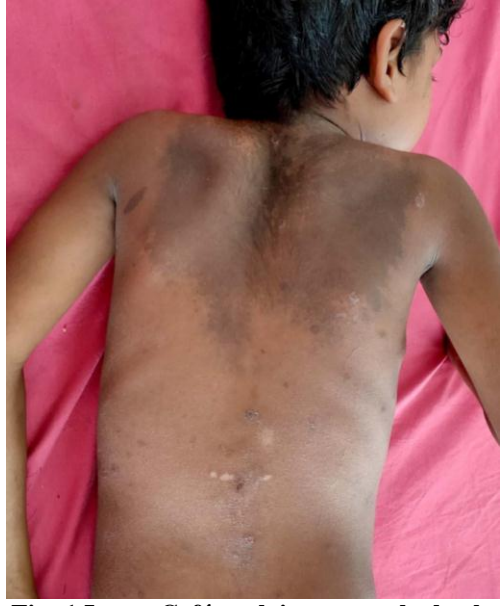
Fig: 1 Large Café-au-lait spot on the back.

Most schwannomas are moderately vascular and their consistency is usually firm. On histopathologic examination, the schwannomas characteristically have 2 patterns- Antoni A and Antoni B. Type A tissue is usually cellular and demonstrates nuclear palisading and the characteristic Verocay bodies. The Verocay body is characterized by prominent extracellular matrix and secretion of the laminin. The Antoni type B pattern is a loosely organized tissue with cystic and myxomatous changes which may also represent the degenerated Antoni A tissue.<sup>[5]</sup> Schwannomas are relatively simple to resect.<sup>[6,7]</sup> For dissection, they have a well-defined arachnoid plane intra- durally and well-defined capsule extradurally. For rapid and complete neurological recovery, the total tumor is to be resected.