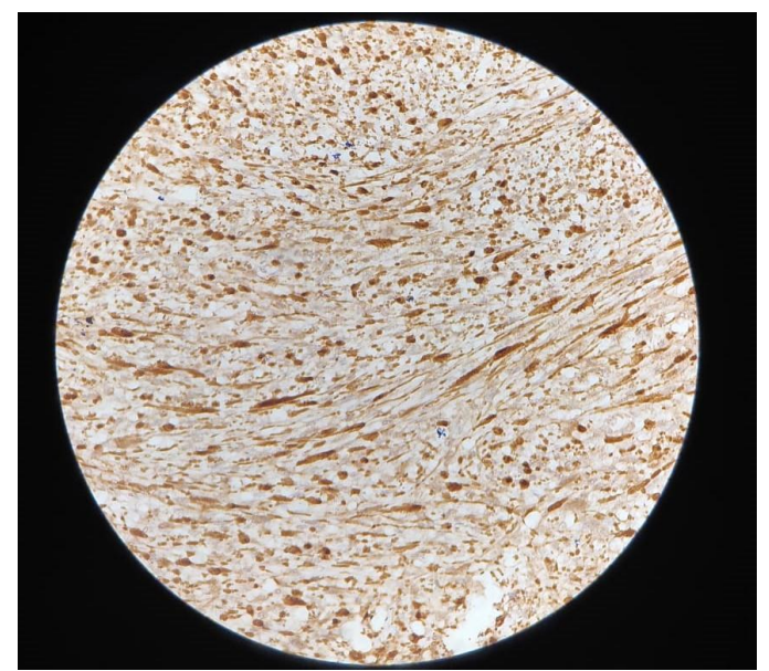
Fig: 6 Immunohistochemistry demonstrating a strongly positive S-100.