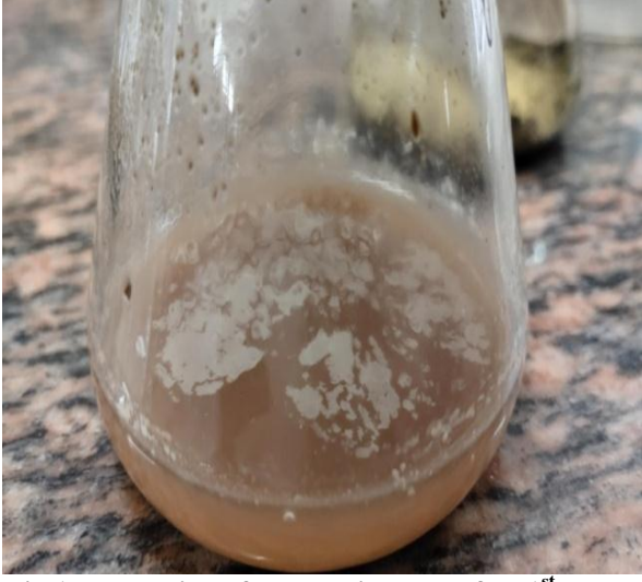
Fig 1: Formation of the turbid layer after 1<sup>st</sup> phase.

of pre – treatment process showed the formation of the turbid layer on the top of the conical flask after completion of incubation period (Fig 1).