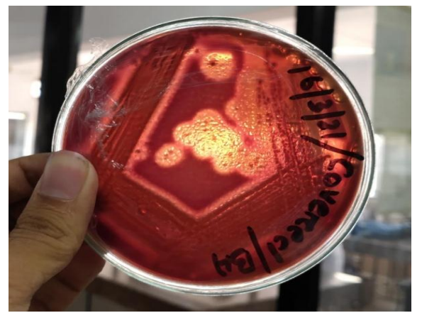
Fig 4: Beta haemolysis was observed by the isolates after incubation period.