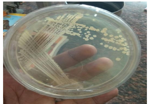
Fig 3: Purification of the isolated Colonies.