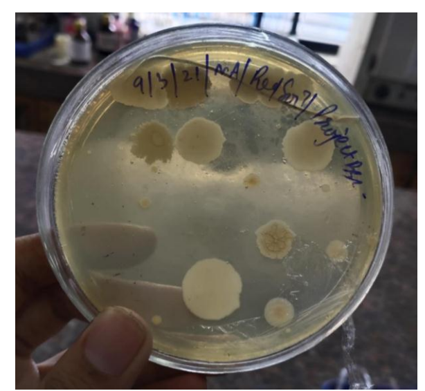
Fig 2: Visualization of colonies similar to the B. Thuringiensis.

The results after the 2^{nd} phase of the pre – treatment process resulted in the formation of the colonies which were creamy to whitish in colour, rough, opaque and spreaded over the plate (Fig 2). When these isolated when subjected to purification, it resulted in the formation of the colonies similar to the B. thuringiensis (Fig 3). The streaking of these isolates on the blood agar showed the formation of beta hemolysis around the colonies developed after the incubation (Fig 4).