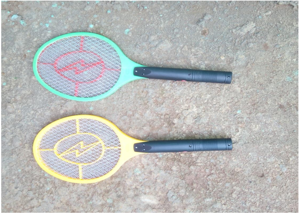
Fig. 3: Electronic rackets used during the mosquito collection in the houses.

simultaneously in the four houses during fourteen consecutive days (two weeks). All collected adult mosquitoes were put in netted plastic cups and transferred to the Laboratory for identification, accounting and recording.