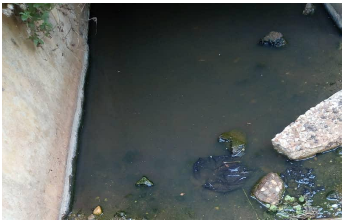
Figure 2: A breeding site of Culex quinquefasciatus larvae surveyed in Dogbo district.

were collected from four potential breeding sites in each location using the dipping method <sup>[13]</sup>. After each dipping method in each breeding site, the number of mosquito larvae were accounted and recorded.