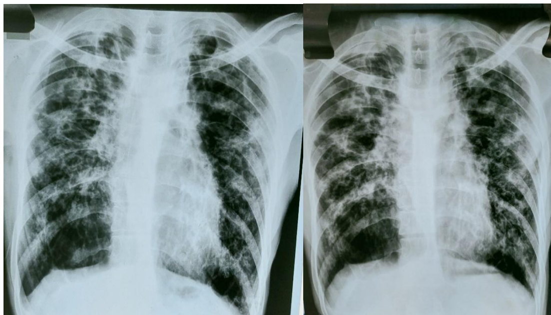
X-RAY CHEST SHOWS BILATERAL HETEROGENOUS OPACITIES AND CAVITY IN RIGHT MIDDLE ZONE AND WAS STARTED ON ATT AS A CASE OF SMEAR NEGATIVE TUBERCULOSIS