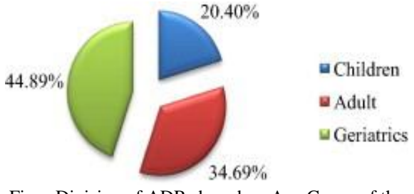
Fig: - Division of ADRs based on Age Group of the patients.

Fig: - Division of ADRs based on gender of the patients.