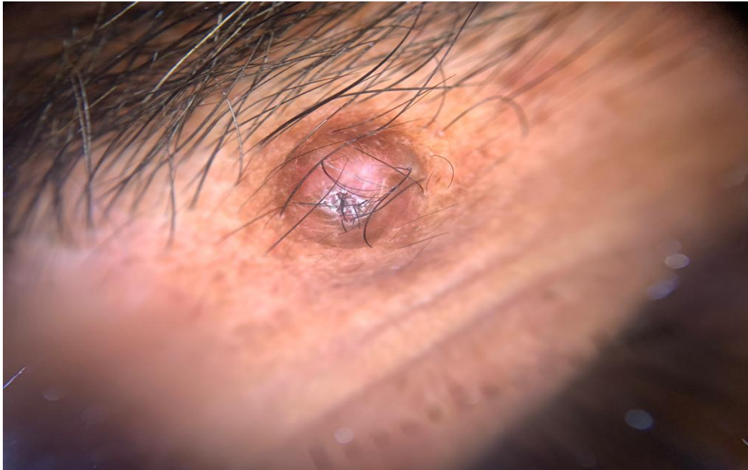
Figure 2: Dermoscopic evaluation showed a nodule with whitish central plug with tuft of hair arising from the centre.