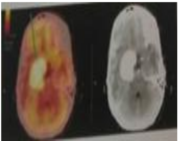
Figure 1: Brain and Neck scan.

Histopathology report: Nasopharyngeal mass, Biopsy: Non-keratinizing nasophpharyngeal carcinoma, undifferentiated type.