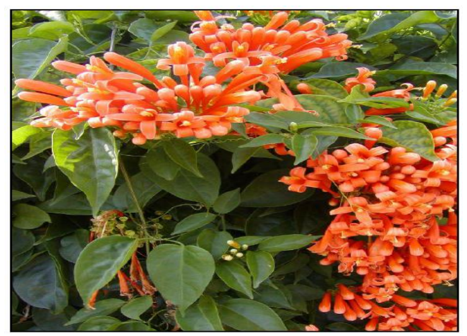
Figure 1: Pyrostegia venusta miers (Family- Bignoniaceae).

Bangalore, Karnataka, India. Brazilian indigenous people use the aerial parts of P. venusta to treat coughs and flu. The decoction of this plant was administered orally as a general tonic for the treatment of diarrhoea, vitiligo and jaundice.<sup>[5,6,7]</sup>