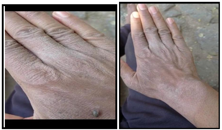
a. Before Treatment