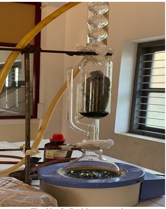
Fig. No. 3: Soxhlet extraction.

The collected polyalthia korintii leaves were dried and powdered. 50g of powdered leaves were packed in thimble of Soxhlet apparatus. The extraction was carried out with chloroform. The extraction was continued till the solvent in the syphon tube become colorless. The solvent were evaporated by using vaporization water bath and the extract were obtained has a semi solid mass in the bottom of flask. Then the extract were subjected to preliminary analysis and antimicrobial activity.