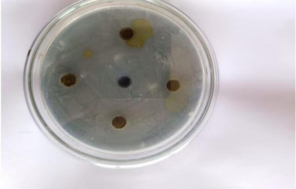
Fig. No.5: E.coli.

Antimicrobial activity using gram negative strain