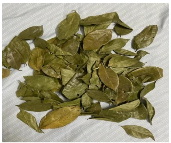
Fig. No. 1: Dried leaves OF Polyalthia korintii.

Fresh leaves were collected shade dry at room temperature to remove moisture, and crushed.