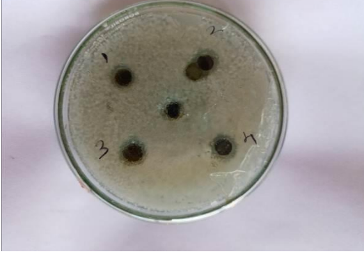
Fig. No.4: Lactobacillus.

Antimicrobial activity using gram positive strain