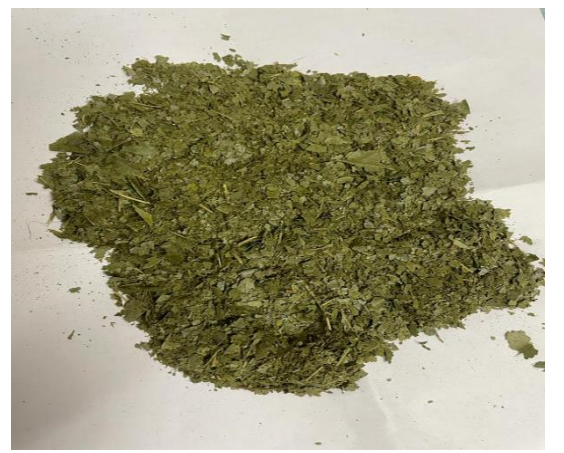
Fig. No.2: Crushed leaves of Polyalthia korintii.