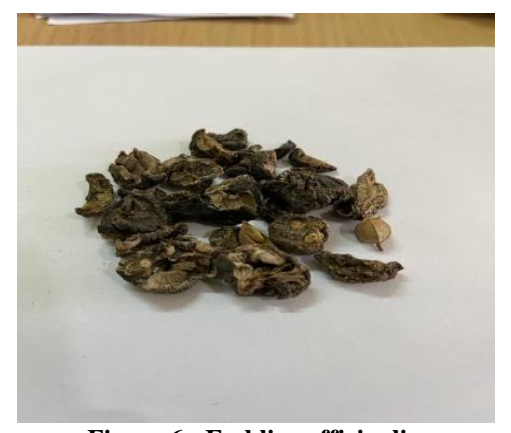
Figure 6 : Emblica officinalis.