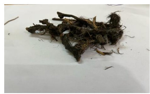
Figure 3: cyperus rotundus.