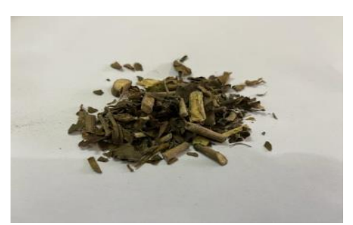
Figure 4: trichosanthes dioica.