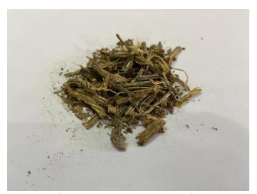
Figure 7: Adhatoda vasica