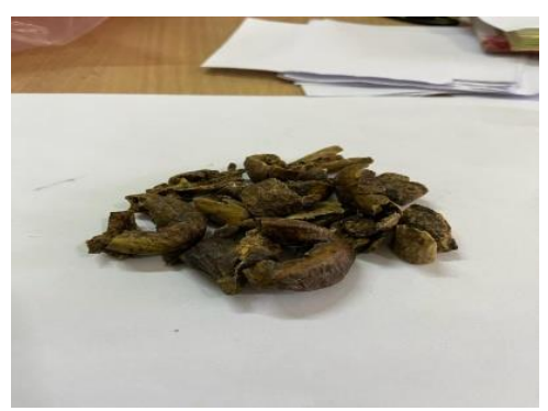
Figure 2: Terminalia chebula.