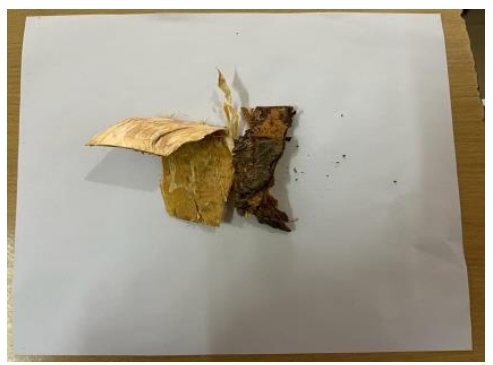
Figure 1: Azadirachta indica.