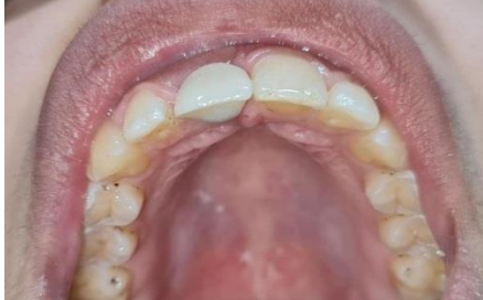
Figure 11: Occlusal view of Zirconium final prosthesis (Case of group A).