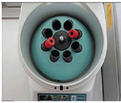
Figure 3: A specific centrifuge with a motor turning at alternated and controlled speed from 2,400 to 2,700 rpm for 12 minutes.