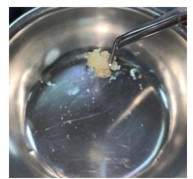
Figure 5: AFG mixed with xenograft particulate bone powder and allows for 5-10 minutes for polymerization in order to produce sticky bone which is yellow colored.