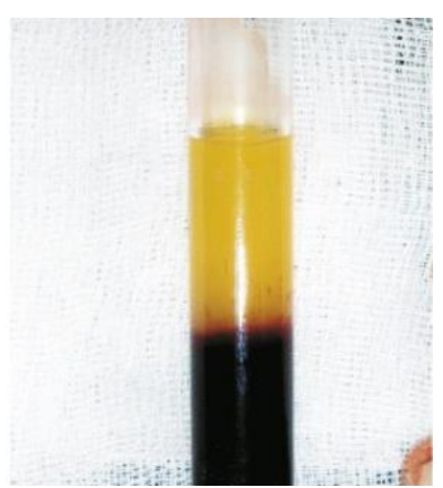
Figure 4: Showing non coated test tube shows two different layers. The upper layer is AFG layer and the bottom layer is accumulation of red blood cell which will be discarded.