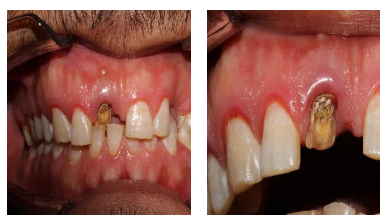
Figure 12: Pre-surgical photographs showing remaining root of previously root canal treated right central incisor (Case of group B).