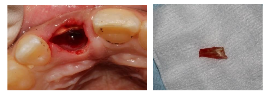
Figure 6: Extraction of palatal part and preparation of labial shield (Case of group A).

Figure 5: AFG mixed with xenograft particulate bone powder and allows for 5-10 minutes for polymerization in order to produce sticky bone which is yellow colored.