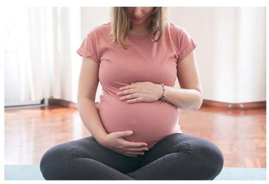
Fig. 5: Impact of PCOD and Pregnancy.