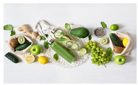
Fig. 8: Common fruits for PCOD.