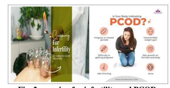
Fig. 2: cupping for infertility and PCOD.

Infertility is a universal health issue and the number of infertile couples around the world is increasing. [1] All around the world, 10% of the population, 13% of women, 10% of men, and 15% of couples of reproductive ages suffer from infertility. The prevalence of infertility in Iran has been estimated 2–5%. [2] Infertility is an unwanted delay in conception after regular unprotected intercourse after 12 months or more. It is a complex disorder with medical, psychological, social, and economic aspects. [3] Infertility, mental disorders, and infertility treatment are related.