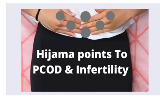
Fig. 7: Cupping point to PCOD & infertility.

PCOD may not affect infertility in most women. They can ovulate and become pregnant with little help. Applying Hijama cups on the front side of the belly and at the lower back helps to target the problem area in the reproductive system that causes infertility.