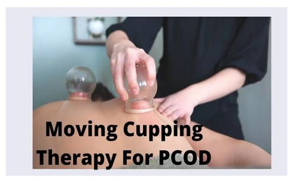
Fig. 6: Cupping therapy for PCOD.

Moving Cupping therapy is an excellent way to improve the symptoms of PCOD like inflammation, obesity, menstrual irregularities, migraines, and digestive disorders. It may also alleviate mental health issues like depression and anxiety attacks. Massage-like moving cupping treatment applies steady pressure to the vein that delivers blood to the uterus and ovaries. That causes blood to rush into the pelvic organs. Women with PCOD can benefit from this by improving circulation to the reproductive system, inducing ovulation, and managing menstruation. Massage therapy may also assist in breaking the connective tissue within the reproductive organs, reducing inflammation and anxiety. Relaxing your muscles and releasing internal tension will help your body sustain a healthy reproductive system.