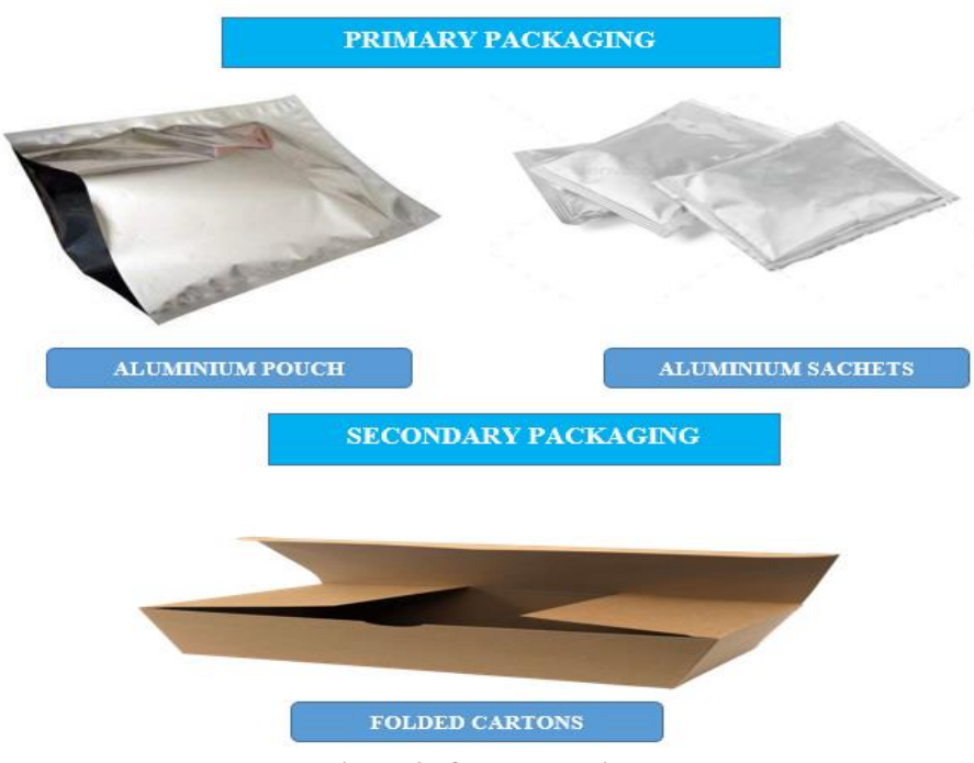
Figure 3: ODF packaging.

In the pharmaceutical industry, it is vital that the package selected adequately preserve the integrity of the product. A variety of packaging options are available for fast dissolving films. An aluminium pouch is the most used packaging material. APR-Labtech developed the Rapid card, patented packaging system designed for the Rapid films. The rapid card has same size as a credit card and holds three rapid films on each side. Every dose can be taken out individually.