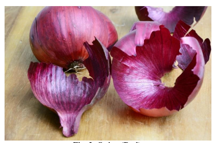
Fig. 2: Onion (Peel).

Onion skins also make a great hair dye, turning it a beautiful golden brown (Darkening & gives the hair brownish, purple hues). Simply add onion skins to a pot of water and boil for 30-60 minutes.