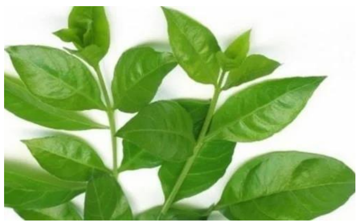
Fig. 5: Organic Henna Leaf.

1yl- naphtha Quinone), which has the ability to bond with protein. The other components like Lawsone 1, 4 – naphtha Quinone; 2- methoxy- 3- methyl- 1, 4 - naphtha Quinone; flavonoids, coumarins and phenolic acids; 5-10% gallic acid and tannin.10 Henna balances the pH of the scalp preventing premature hair fall and graying of hair.