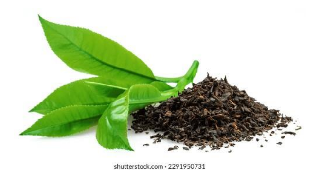
Fig. 9: Tea Leaves.