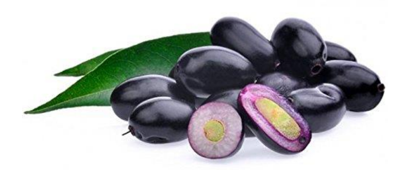
Fig. 4: Indian Black Berry.

Consuming foods rich in these compounds may lower oxidative stress, a condition that occurs when harmful compounds such as free radicals overwhelm the body's antioxidant defenses, and protect hair follicle cells from oxidative damage, thus promoting healthy hair growth.