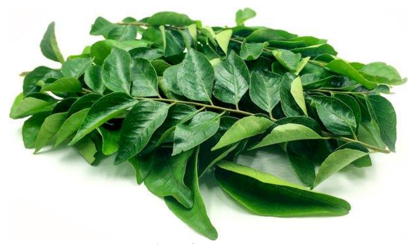
Fig. 6: Curry Leaves.

vitamin B, which help in increasing melanin production, thus restoring the natural hair pigment deep down in the follicles. Curry leaves also include minerals like selenium, zinc, iodine and iron that delay the onset of grey hair.