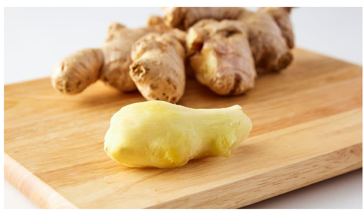
Fig. 3: Ginger (Peel).