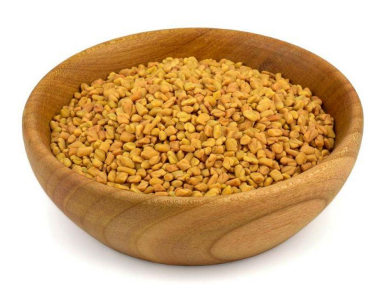
Fig. 8: Organic Methi Seed (Fenugreek).

environment which contributes hair growth, it boosts shine, it repair the hair shaft from damage caused by heat tools and colouring.