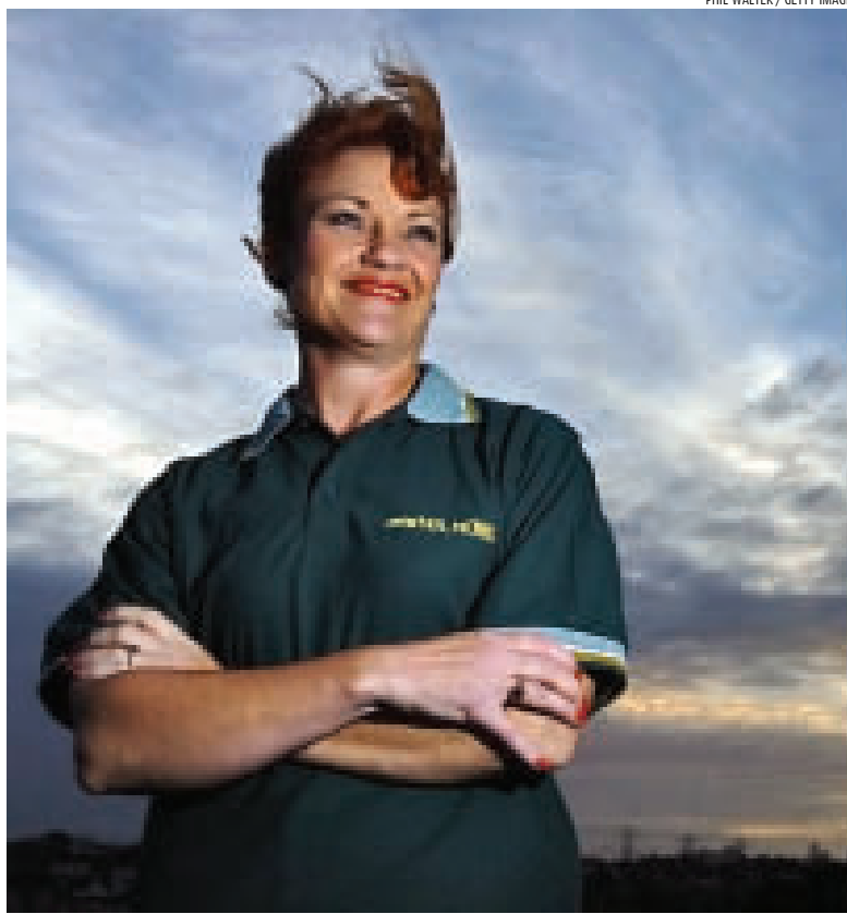
Pauline Hanson has reconsidered a move to England after a month-long tour

Ms Hanson said that some of the residents she came across "don't even speak the English language". She added: "People in England are not particularly happy with the amount of people that have been allowed into the country." Her concern was over Britain "being dictated to by the EU". The politi-