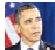
President Obama will defend health reforms tomorrow

In the week when Mr Obama's State of the Union address will set the policy agenda for the coming year, conservatives positioning themselves as his