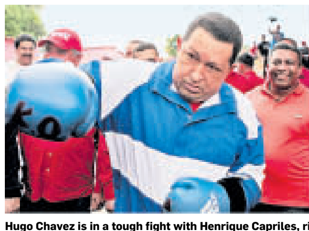
Hugo Chavez is in a tough fight with Henrique Capriles, right, who has had no difficulty winning over large crowds

Talk your way out of this, Presidente, Profile, page 25