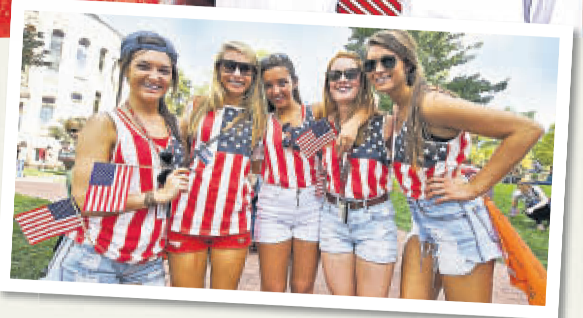
Mitt Romney's performance in the debate, watched by Denver students, below, has put his campaign back on track