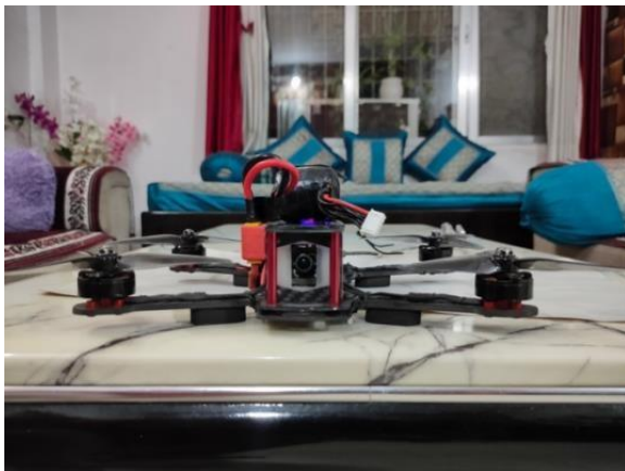
Figure 3. Transporting Medical Equipment.

Based on the experimental results, it can be concluded that the drone is capable of carrying a medical kit weighing up to 750gms for a distance of 2 kilometers. The drone was able to maintain a stable flight and the medical kit remained securely attached to the drone throughout the flight. This suggests that the drone is a viable option for transporting medical equipment over short distances as shown in Figures 3 and 4 [20].