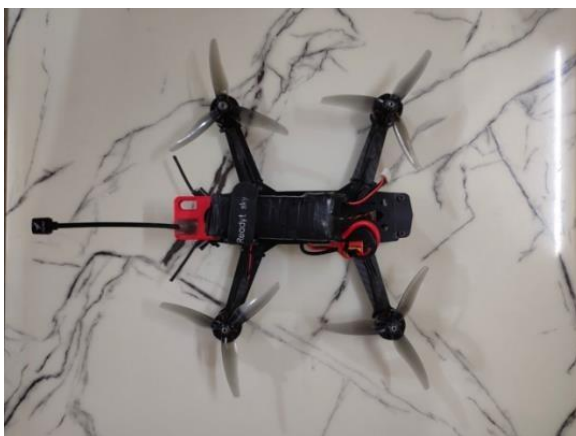
Figure 4. Battery Capacity.