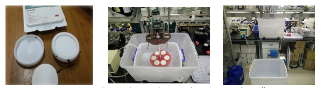
Fig. 1. Chemcatcher sampler, Experiment setup and sampling