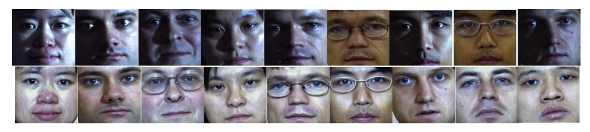
Fig. 9. Faces images after applying the ASVD_W algorithm