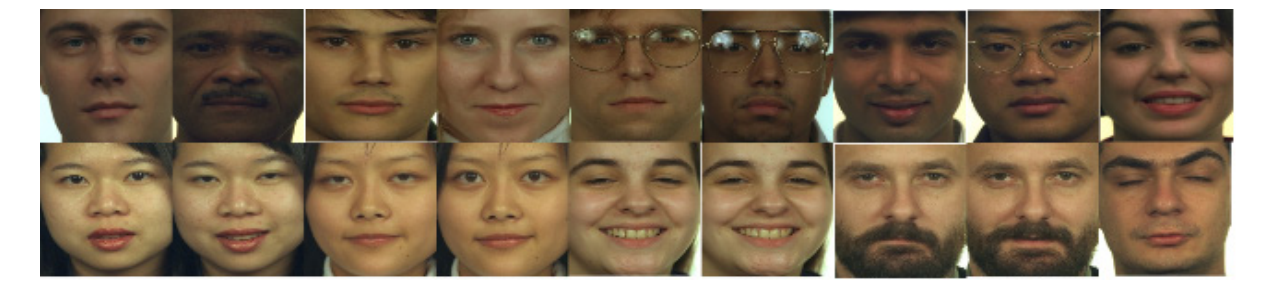
Fig. 3. Faces images in FERET image database