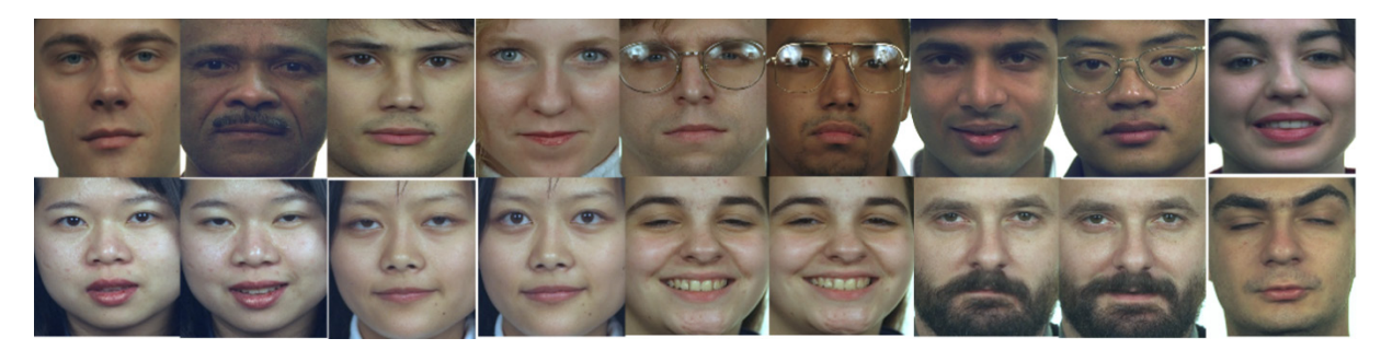
Fig. 4. Faces images after applying the GASVD_F algorithm

This demonstrates the outstanding advantages of the proposed algorithm. The tested results of up to 1800 images in the FERET image database set with three algorithms are shown in Figure 7, Figure 8, Figure 9 and Figure 10 and Table 2.