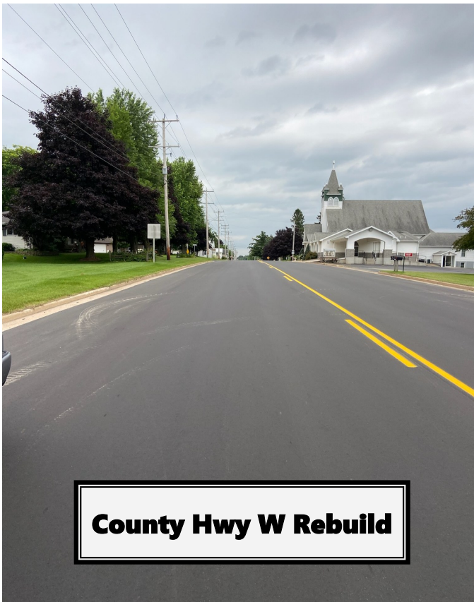
County Hwy W Rebuild

What about County Highways H and HH? These roads are recognized by the County as needing significant repair. While they are on the County's list for future work, no timeline has been established yet. The Town Board will continue to advocate for improvements and keep residents informed as updates become available.