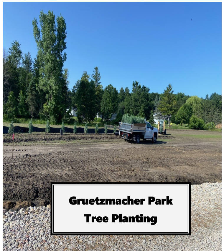
Gruetzmacher Park Tree Planting