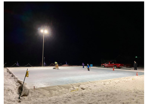
Fun at the Holdingford skating rink. Lights available. Come check it out.