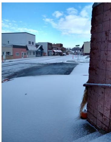
Day 47 – Paving has begun!! Mother Nature thought snow would help.