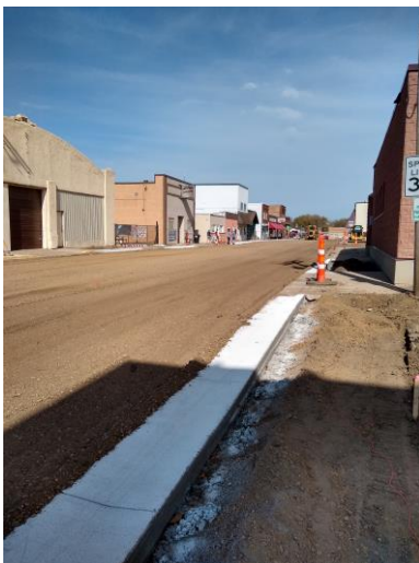
Day 40 – Ready for new sidewalks.