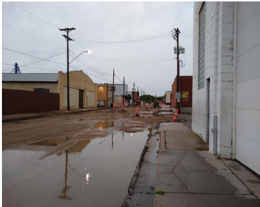
Day 4 – Rain causes delays.