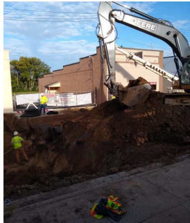
Day 19 – Replacing last brick manhole in town.