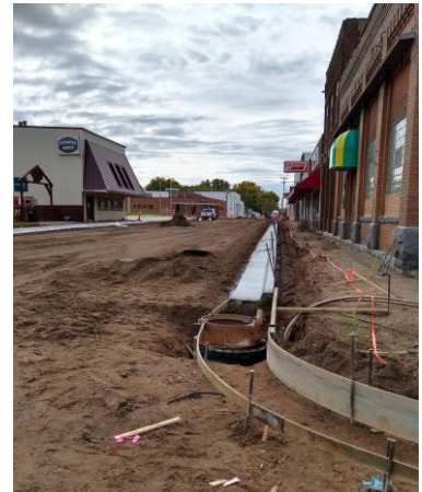
Day 35 – Putting in new curbing.