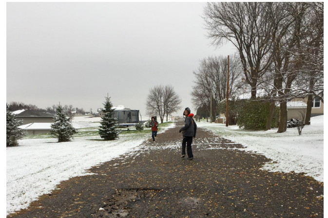
Left to right, from top left: students crossing County Road 17 during dismissal; southeast landing at the crossing of County Road 9/River Street at 3rd Street; portion of Lake Wobegon Trail just south of County Road 9 in downtown Holdingford; the informal connection between the Elementary and Junior/Senior High Schools, in the grass along the tennis courts; segment of the pedestrian-only street that connects to County Road 17 and provides access to students walking.