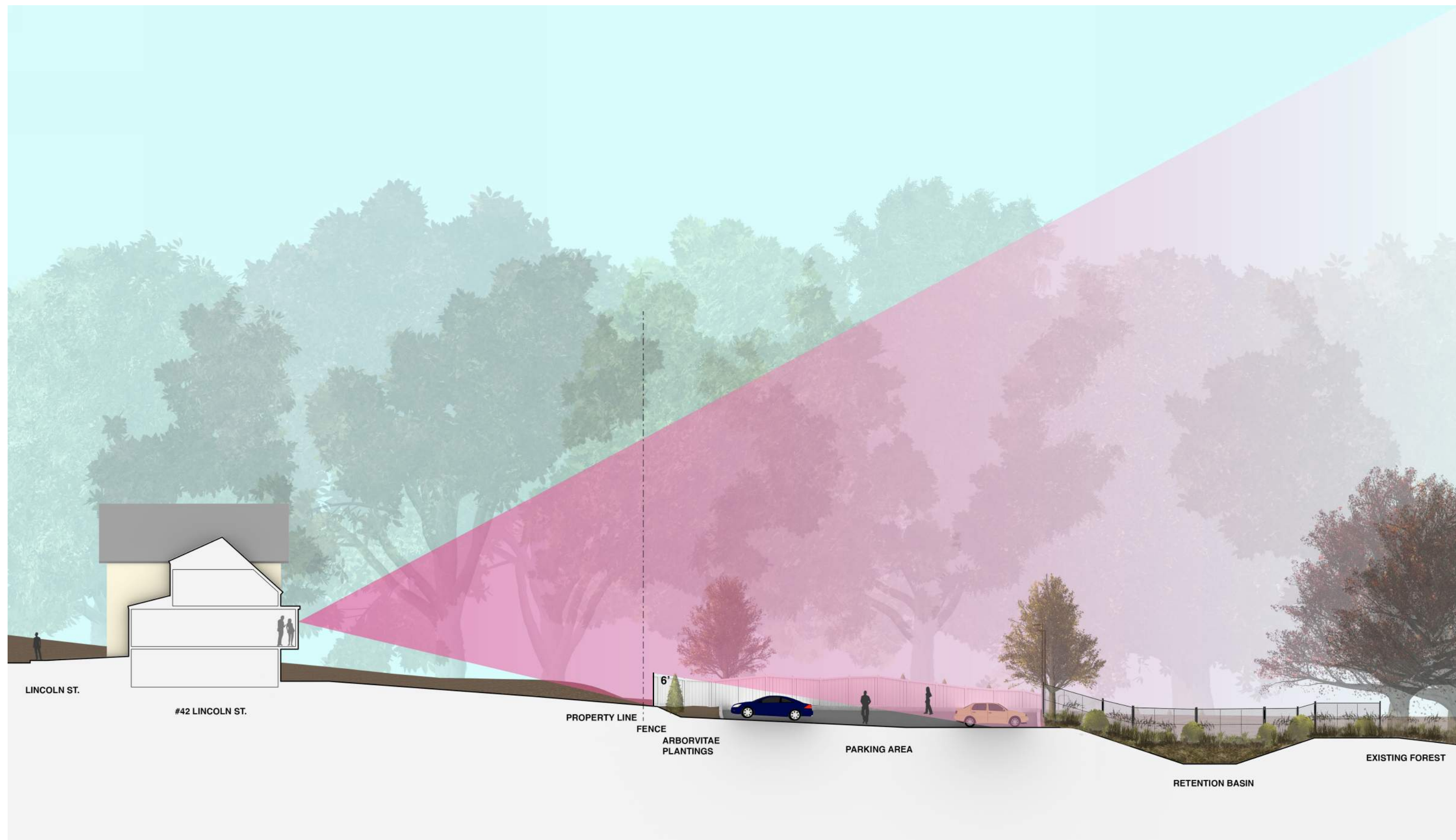
SITE SECTION THROUGH PARKING AREA ARBOR VITAE AT 6 FEET (AT PLANTING)

PLANNING BOARD SITE PLAN REVIEW OWNER: 165 MAIN STREET REALTY TRUST MAY 11, 2021