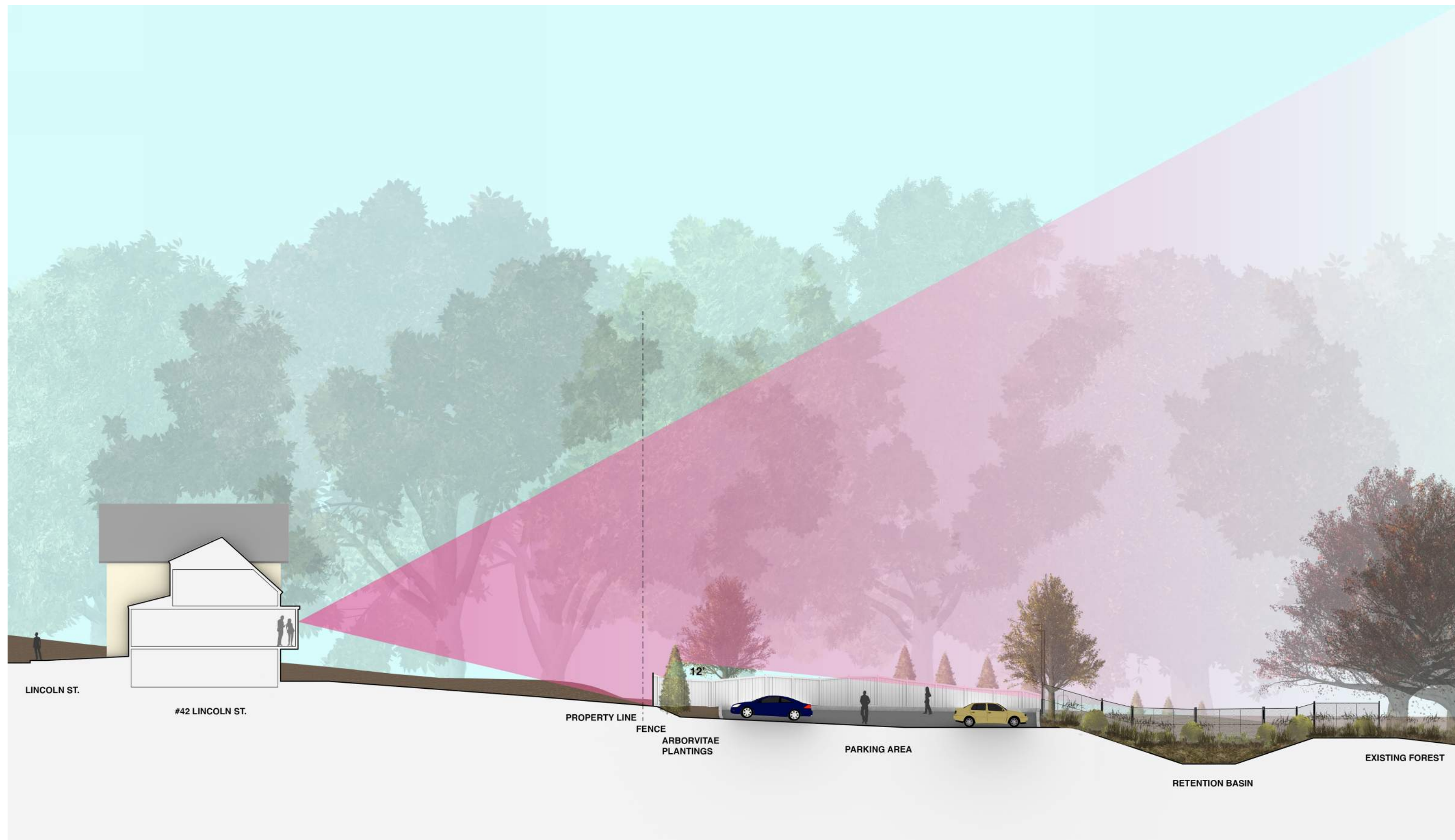
SITE SECTION THROUGH PARKING AREA ARBOR VITAE AT 12 FEET (3 YEARS)

PLANNING BOARD SITE PLAN REVIEW OWNER: 165 MAIN STREET REALTY TRUST MAY 11, 2021 PROPOSED PARKING AREA MEDWAY MILLS