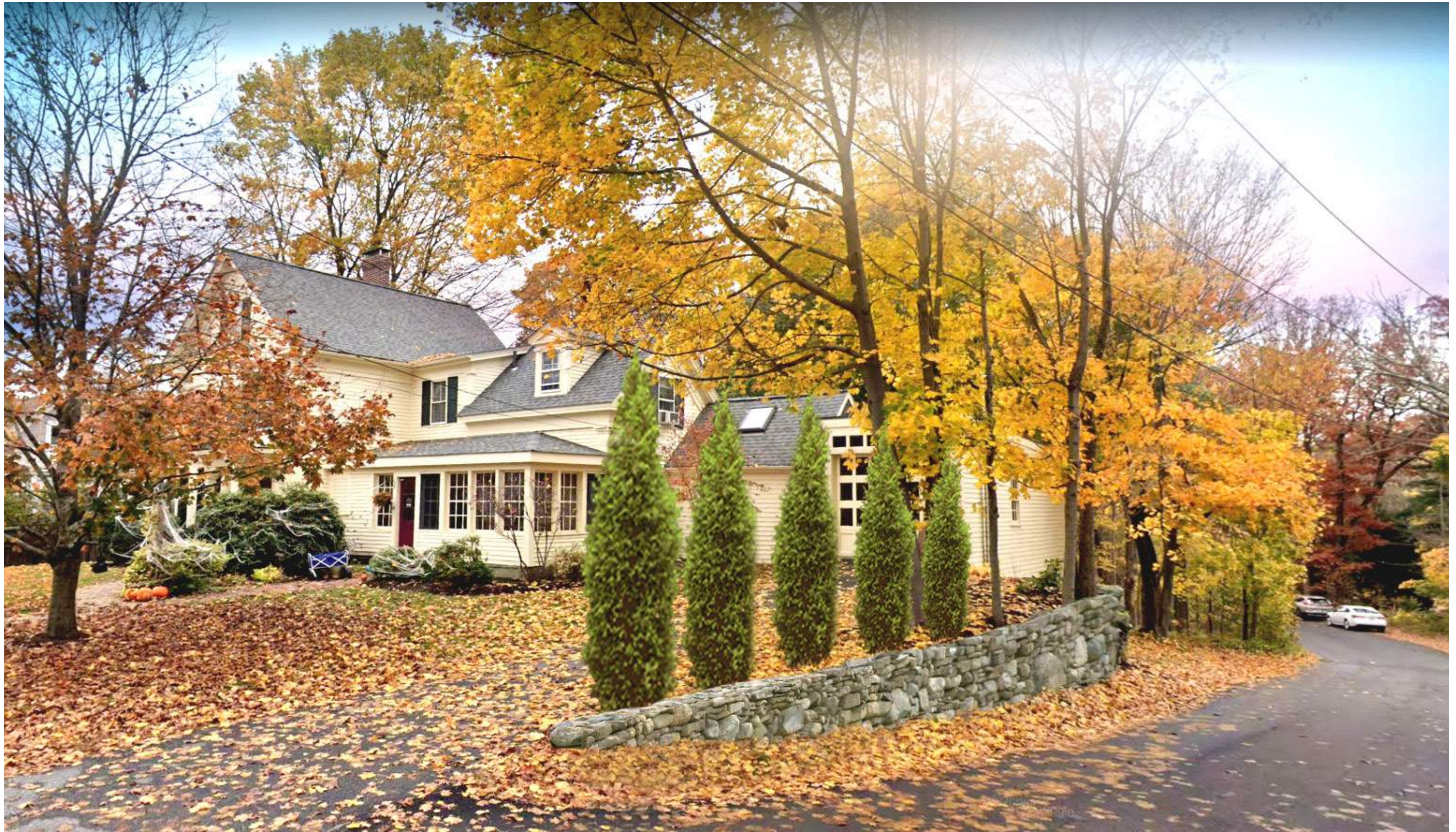
PERSPECTIVE VIEW AT MEDWAY MILLS ENTRY FROM LINCOLN STREET

PLANNING BOARD SITE PLAN REVIEW OWNER: 165 MAIN STREET REALTY TRUST MAY 11, 2021 PROPOSED PARKING AREA MEDWAY MILLS