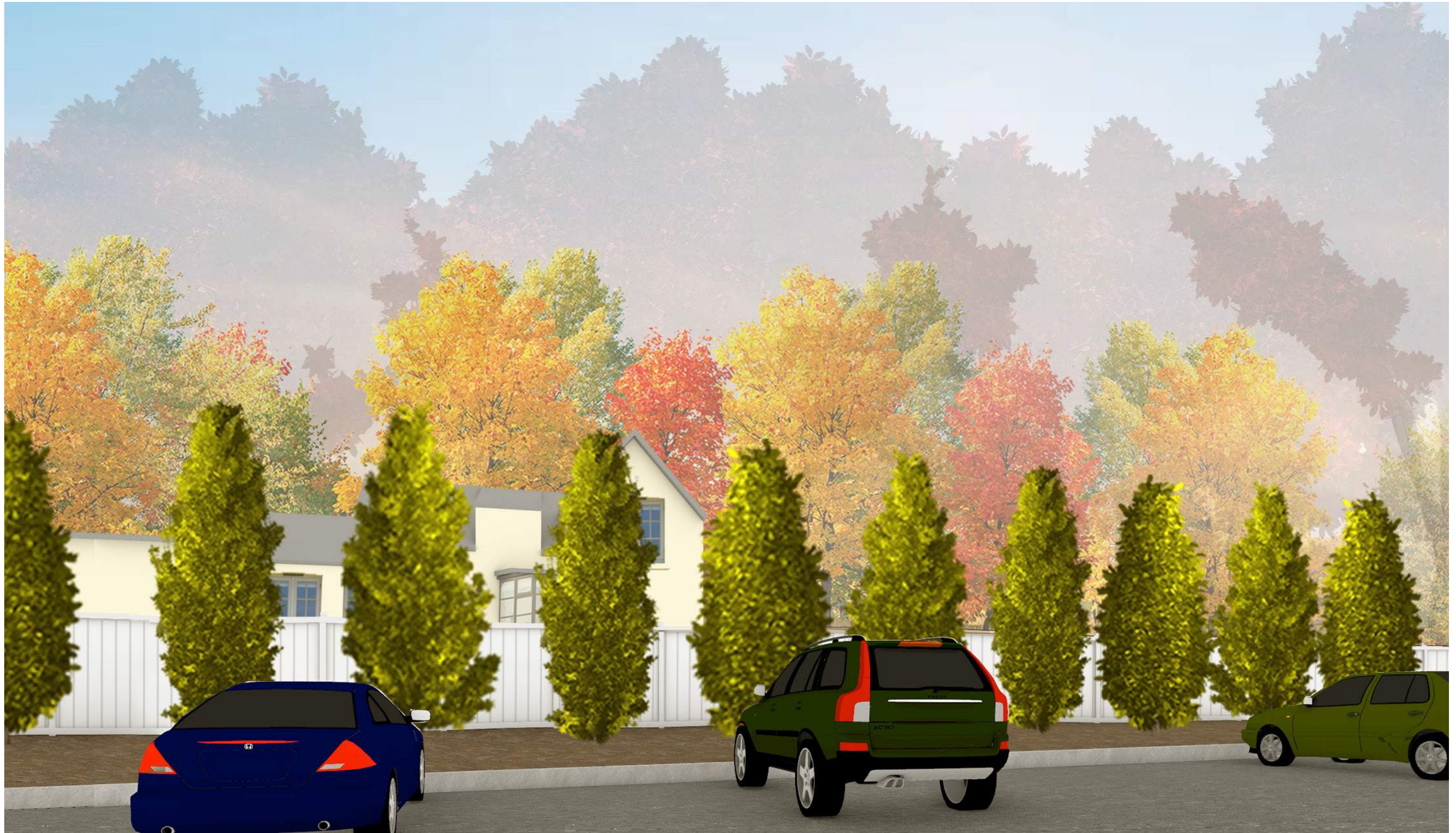
PERSPECTIVE VIEW FROM PARKING AREA ARBOR VITAE AT 22 FEET (YEAR 8)

PLANNING BOARD SITE PLAN REVIEW OWNER: 165 MAIN STREET REALTY TRUST MAY 11, 2021