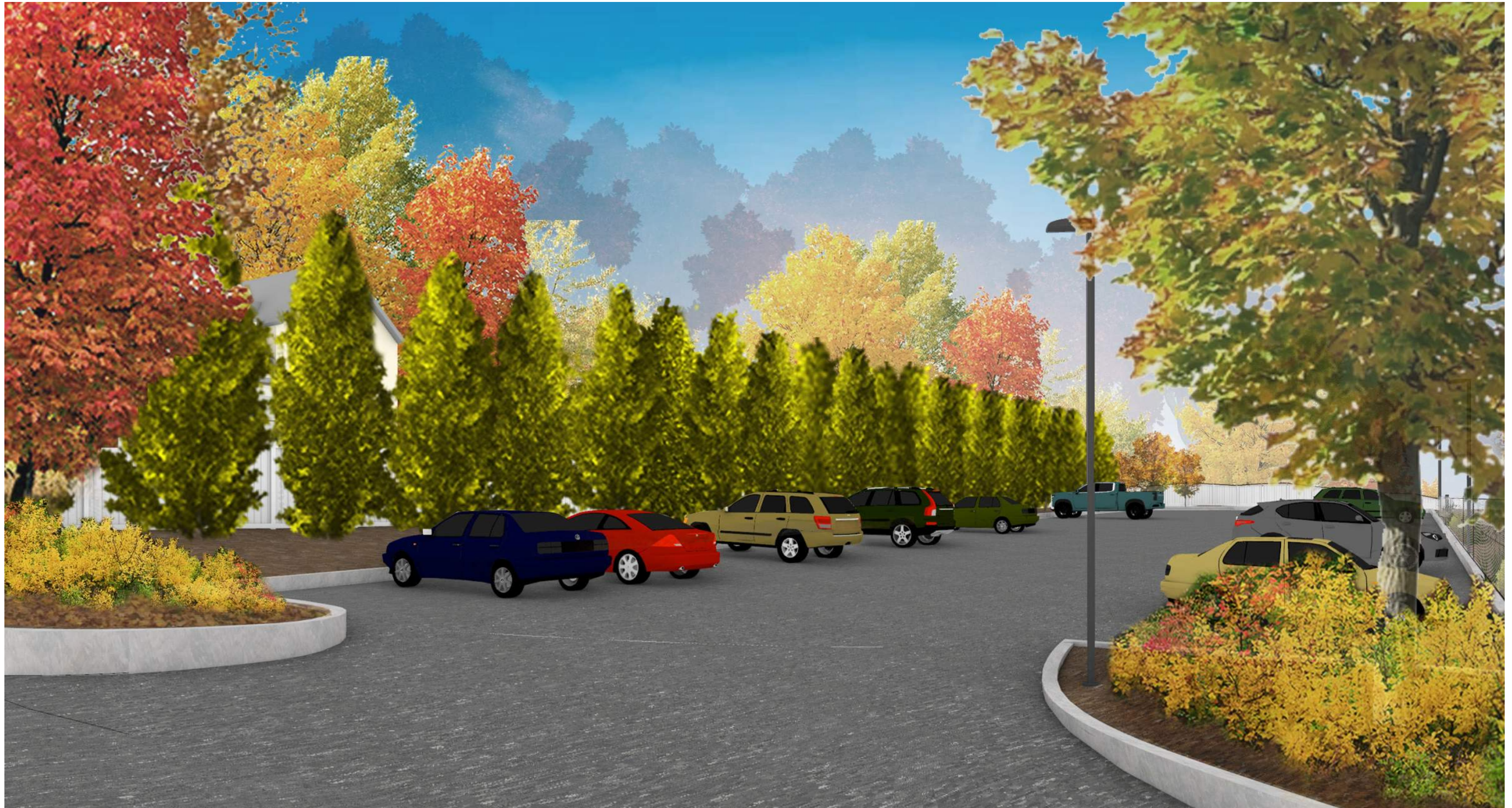
PERSPECTIVE VIEW FROM DRIVE ARBOR VITAE AT 26 FEET (YEAR 10)

PLANNING BOARD SITE PLAN REVIEW OWNER: 165 MAIN STREET REALTY TRUST MAY 11, 2021