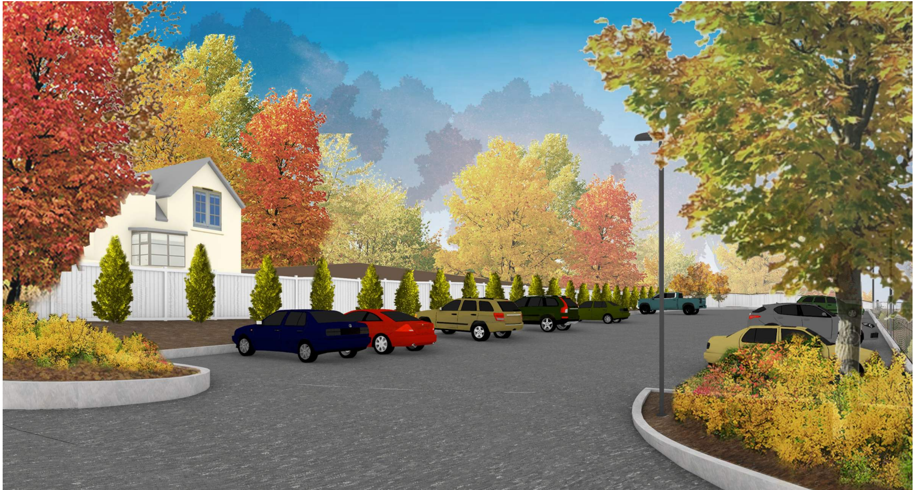
PERSPECTIVE VIEW FROM DRIVE ARBOR VITAE AT 12 FEET (YEAR 3)

PLANNING BOARD SITE PLAN REVIEW OWNER: 165 MAIN STREET REALTY TRUST MAY 11, 2021