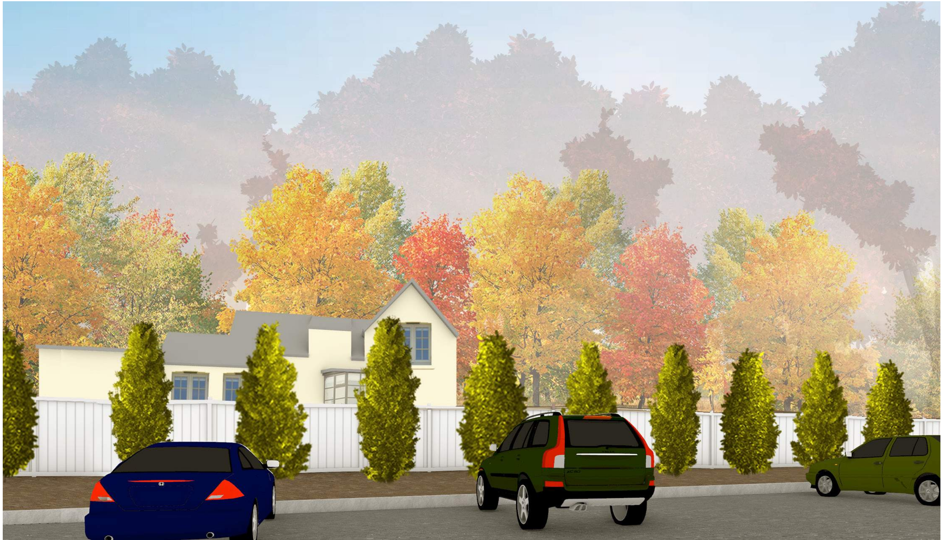
PERSPECTIVE VIEW FROM PARKING AREA ARBOR VITAE AT 16 FEET YEAR 5

PLANNING BOARD SITE PLAN REVIEW OWNER: 165 MAIN STREET REALTY TRUST MAY 11, 2021