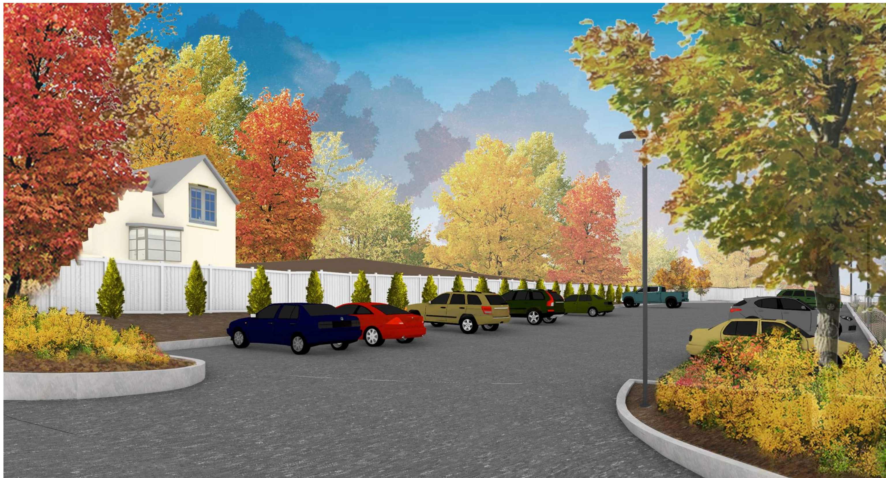
PERSPECTIVE VIEW FROM DRIVE ARBOR VITAE AT 6 FEET (AT PLANTING)

PLANNING BOARD SITE PLAN REVIEW OWNER: 165 MAIN STREET REALTY TRUST MAY 11, 2021 | PROPOSED PARKING AREA MEDWAY MILLS