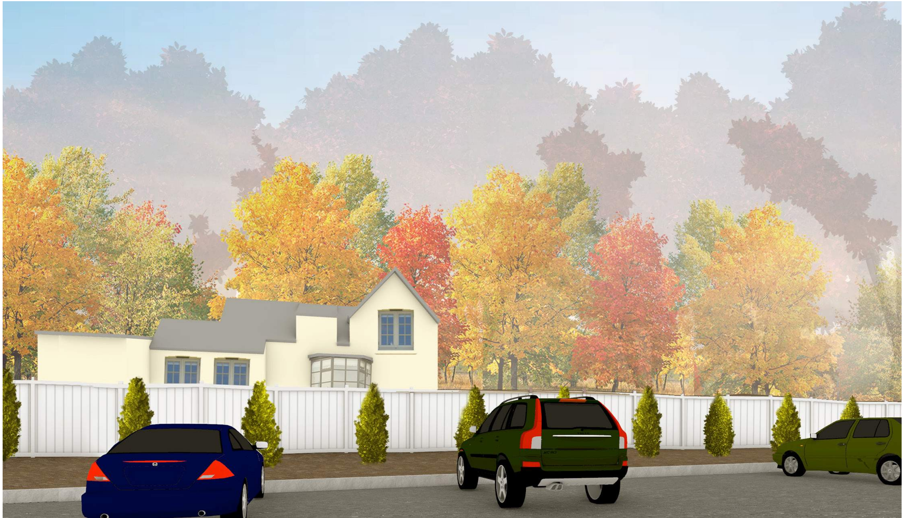
PERSPECTIVE VIEW FROM PARKING AREA ARBOR VITAE AT 6 FEET (AT PLANTING)

PLANNING BOARD SITE PLAN REVIEW OWNER: 165 MAIN STREET REALTY TRUST MAY 11, 2021