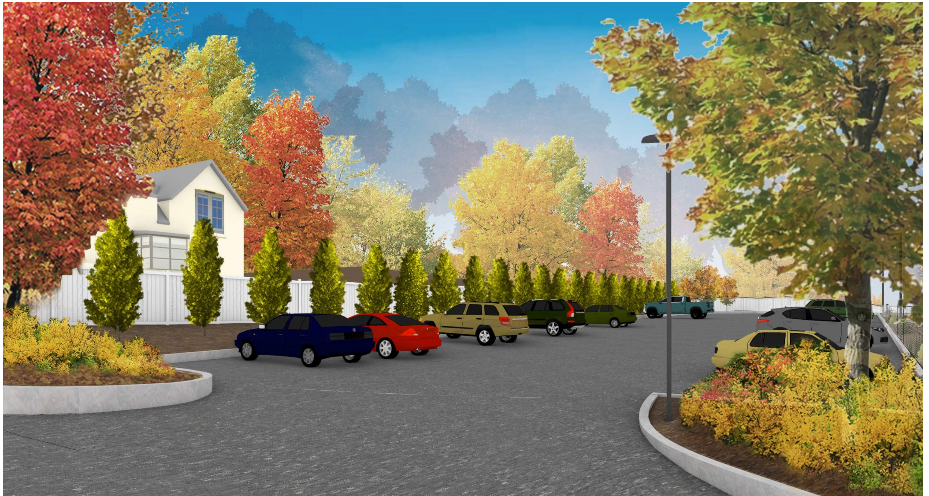
PERSPECTIVE VIEW FROM DRIVE ARBOR VITAE AT 16 FEET (YEAR 5)

PLANNING BOARD SITE PLAN REVIEW OWNER: 165 MAIN STREET REALTY TRUST MAY 11, 2021