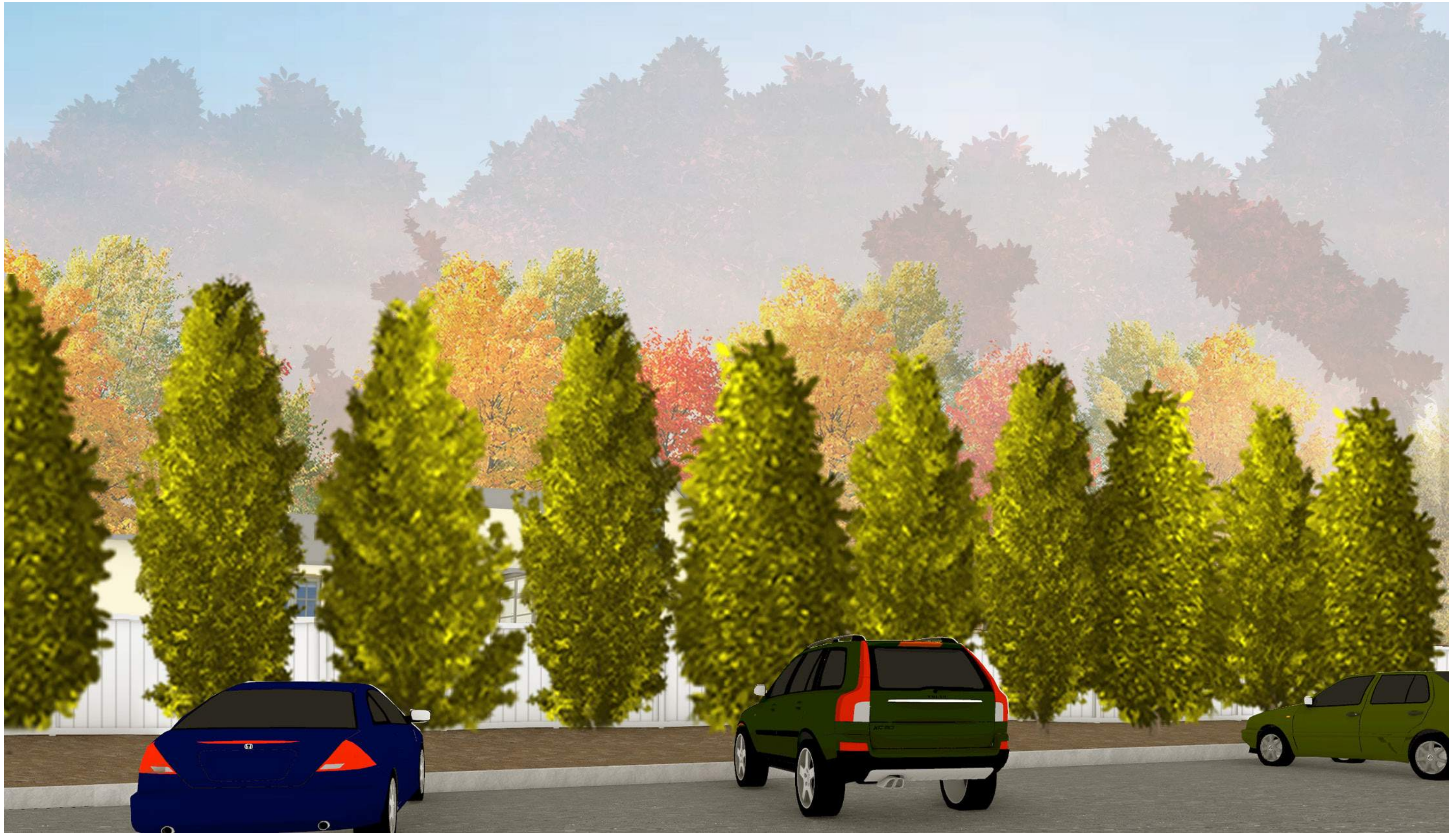
PERSPECTIVE VIEW FROM PARKING AREA ARBOR VITAE AT 26 FEET (YEAR 10)

PLANNING BOARD SITE PLAN REVIEW OWNER: 165 MAIN STREET REALTY TRUST MAY 11, 2021