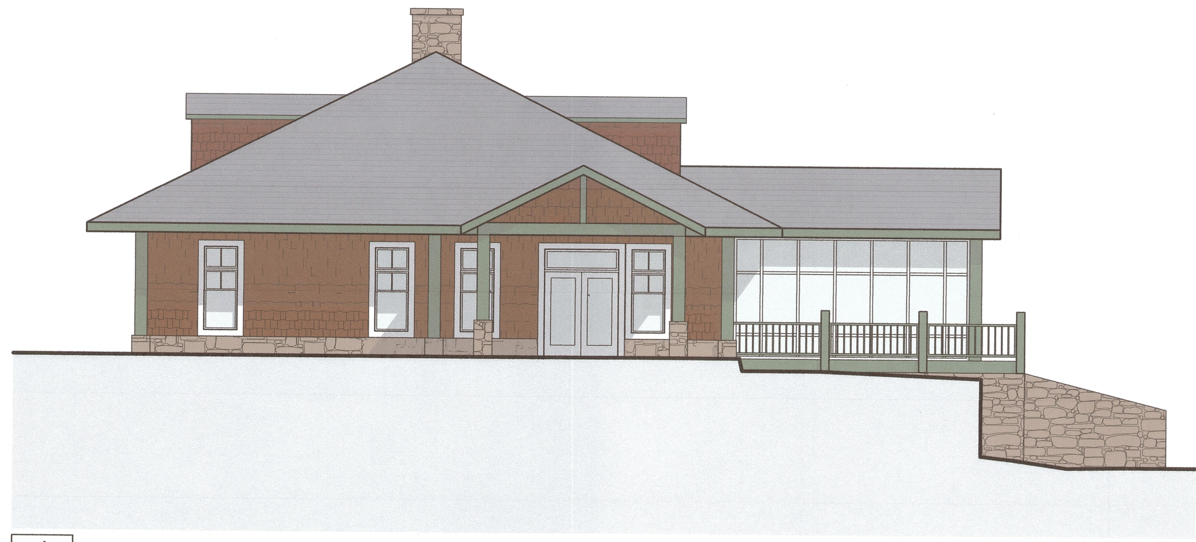
4 EXTERIOR ELEVATION ~ NORTH Scale: 1/8" = 1'-0"