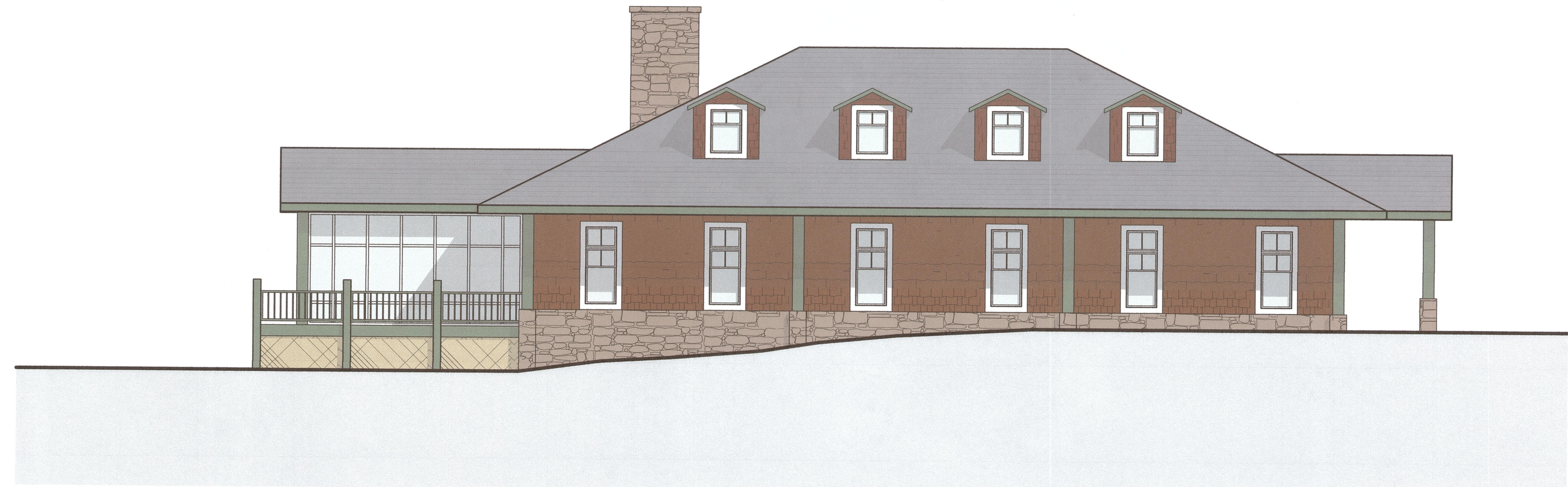
3 EXTERIOR ELEVATION ~ EAST Scale: 1/8" = 1'-0"