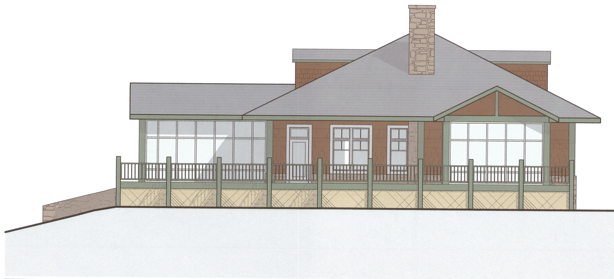
2 EXTERIOR ELEVATION ~ SOUTH Scale: 1/8" = 1'-0"