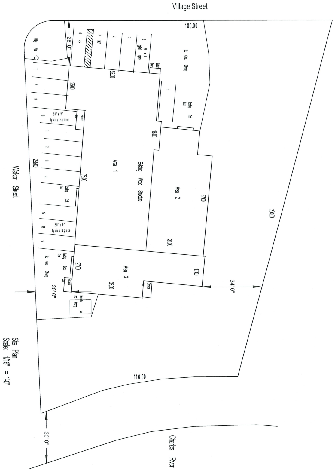
Site Plan Scale: 1/16" = 1'-0"