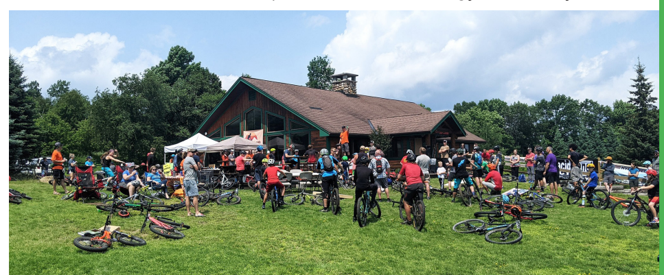
2022 EVENTS: Pisgah Pedalfest (over one-hundred participants/volunteers), various ski team trainings and competitive races, youth ski lessons, and the annual Winter Carnival races and torchlight skiing.