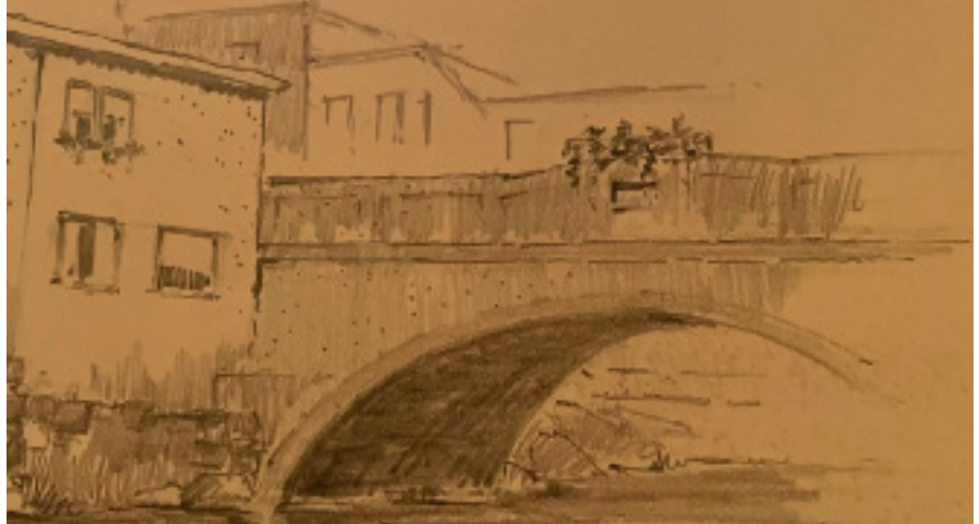
Town's first high school was located at the site of the Hotel Saranac, 1843 Broadway Bridge sketch by William Distin, 1966