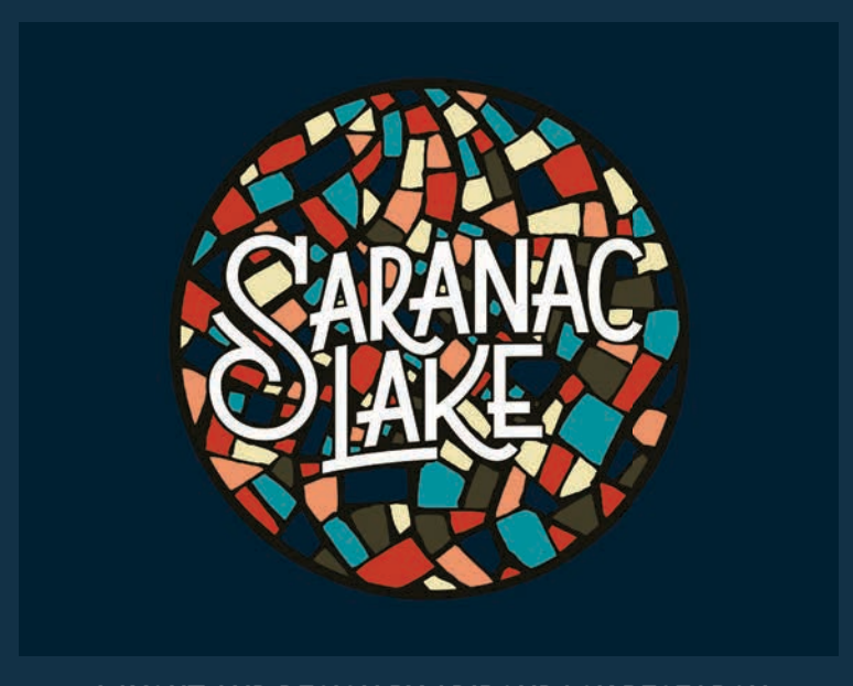
LAYOUT AND DESIGN BY ADIRONDACK RESEARCH