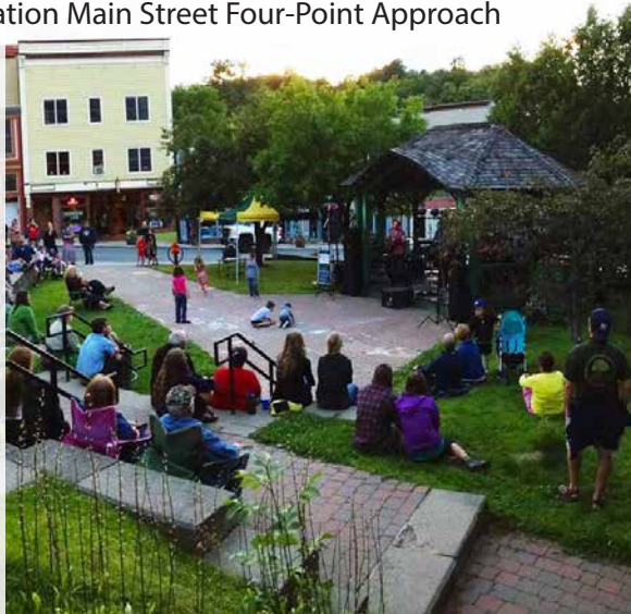
Music on the Green