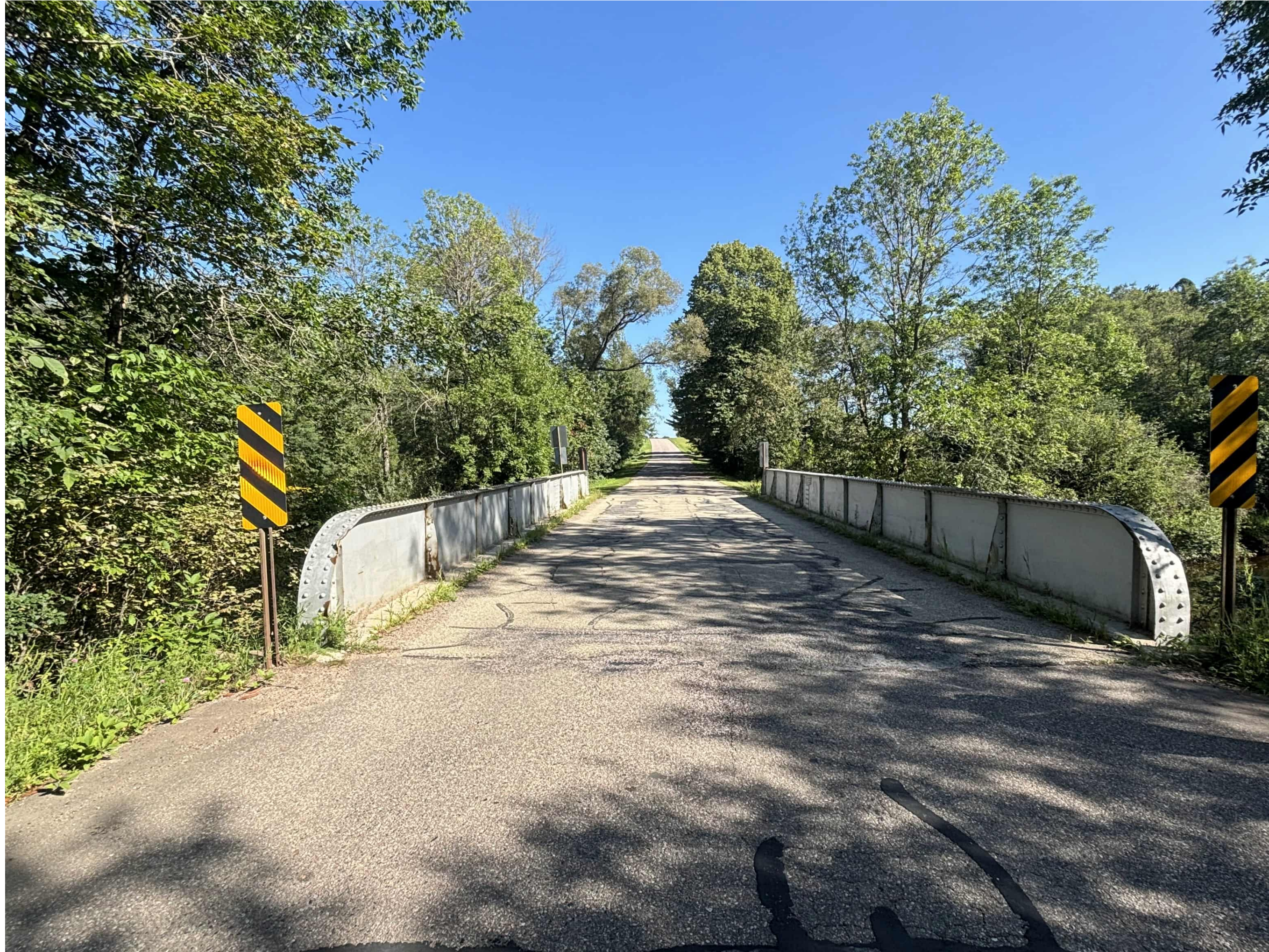
Deficient, Two-Lane Bridge with Inadequate Clear Width