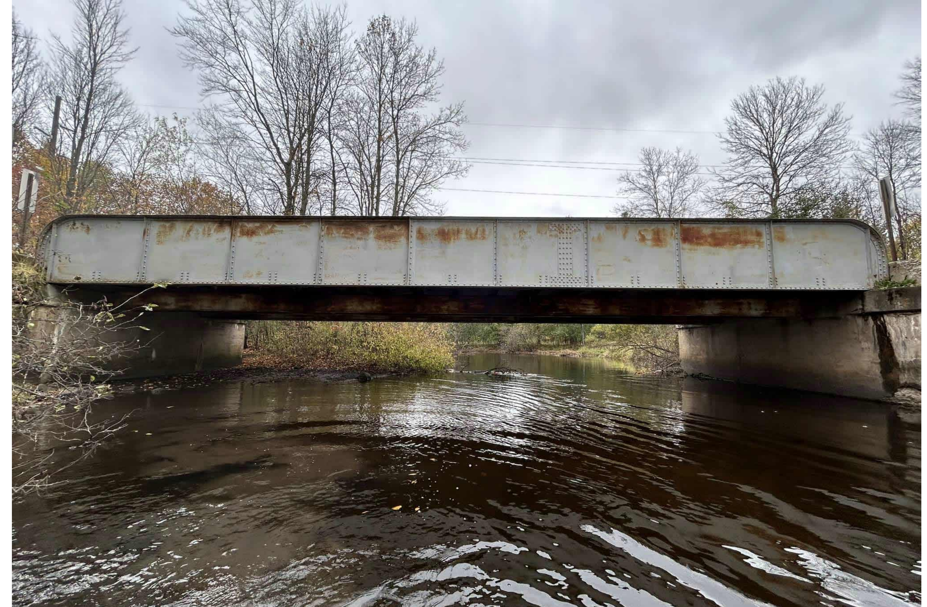
Inadequate Freeboard Clearance Between Structure and Water