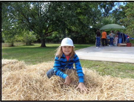
Looking for toys in the straw