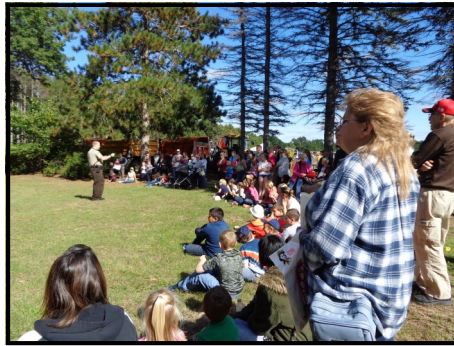
Officer K-9 Axel Demonstration