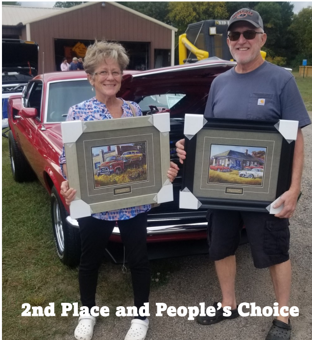
2nd Place and People's Choice