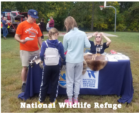
National Wildlife Refuge