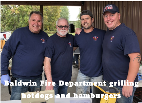
Baldwin Fire Department grilling hotdogs and hamburgers