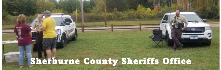
Sherburne County Sheriffs Office