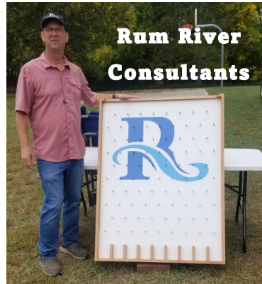
Rum River Consultants