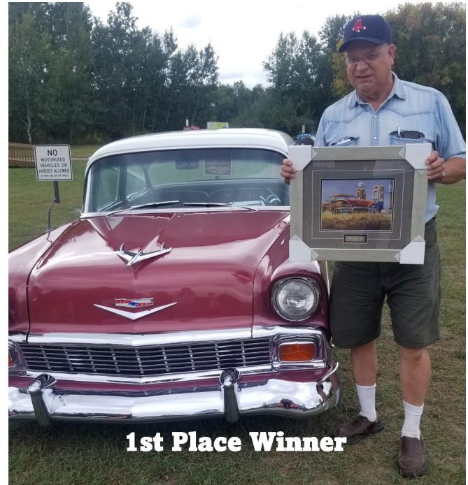
1st Place Winner