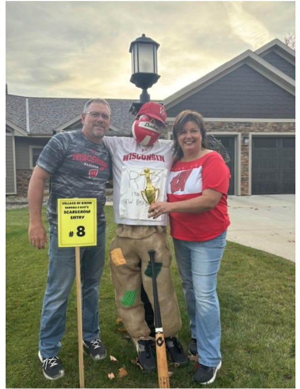
2nd Place Winner

Thank you for everyone that participated and volunteered in our first Scarecrow contest! These are our 1st, 2nd and Village Choice Winners!