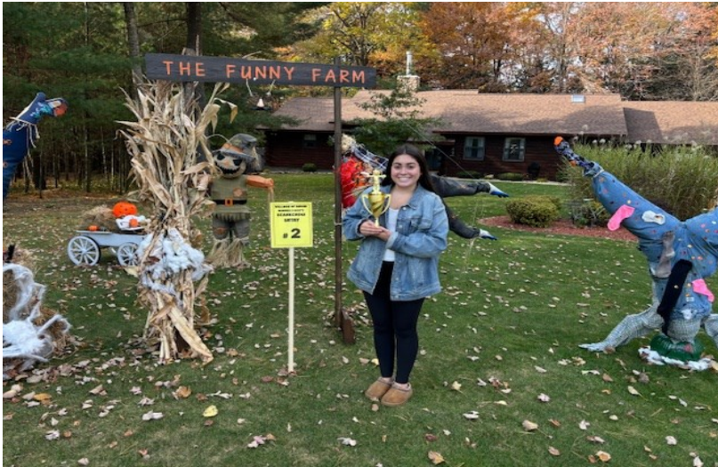
1st Place Winner

Thank you for everyone that participated and volunteered in our first Scarecrow contest! These are our 1st, 2nd and Village Choice Winners!