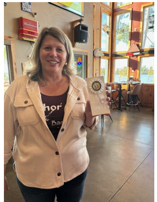
Village Choice Winner

May 15th — Biron's parks restrooms will be open for the season and boat docks will be installed.