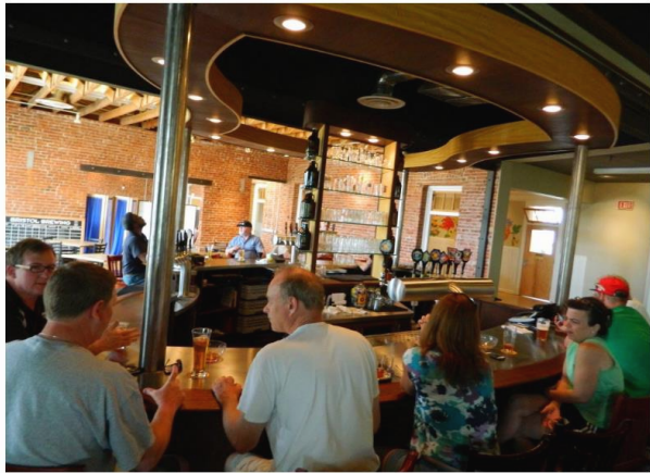
Bristol Brewing Co. of Colorado Springs is located in a renovated former elementary school south of downtown Colorado Springs, part of the $5 million Ivywild School project.