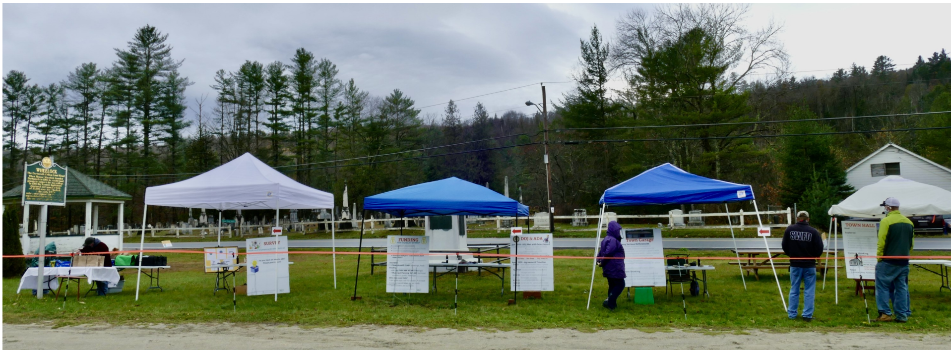
Above : 5 info panels, food at left. Below L : Town Hall discussion. Task Force members at R. Below R : Discussing Fall survey results, post-its to add ideas.