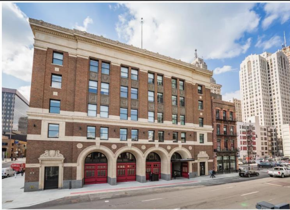
Detroit's new boutique Foundation Hotel was converted from the old Detroit Fire Department Headquarters.