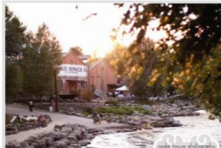
This steam power plant was built in Salida, Colorado, by Salida Edison Electric Light Co. The oldest part of the current building dates to 1887 and Salida's first public lights were illuminated on 7 Dec 1887, just five years after Thomas Alva Edison installed the Pearl Street power plant in New York City.

The Salida steam plant was operated only intermittently starting around 1921, reacquired in 1948, placed on standby in 1954, and retired in 1983, after which the structure was used for storage. In 1987, the building was purchased for $25,000 by Salida Enterprise for Economic Development, which then donated the property to the city. In 1989, the facility was converted into a theater venue known as the Steam Plant Theater and, in 1995, the outdoor Sculpture Garden opened on the grounds. The SteamPlant is now considered one of the most beautiful and historic theaters in the region.