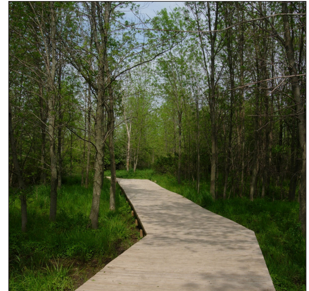
FIGURE 1: A trail system in the Lion's Den Gorge Nature Preserve.

Additional information relating to implementation and a capital improvement schedule can be found in the Town of Grafton Comprehensive Outdoor Recreation Plan.