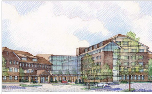
FIGURE 4: Columbia St. Mary's Hospital Ozaukee Campus.

The nearest electric power generation facility to the Town is for WE Energies, and is located in the City of Port Washington.