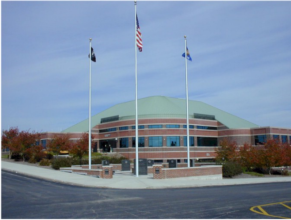
FIGURE 5: Ozaukee County Justice Center.

Lasata Heights, Newcastle Place, and the Sarah Chudnow Campus offer a variety of retirement community services ranging from independent living (with additional personal care services) to assisted living and nursing home facilities.