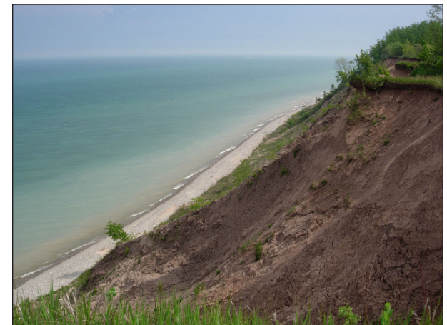
FIGURE 2: A view of a Lake Michigan from the Town of Grafton shoreline.