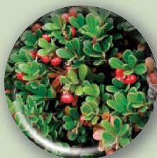
BEARBERRY Arctostaphylos uva-ursi

A popular ground cover whose name comes from the grape-like fruit it produces. It produces clusters of small, white-to-pink, urn-shaped flowers that bloom from May to June. The fruit is bright red to pink that will persist on the plant into early winter. The fruit is eaten by a few species of songbirds and game animals.