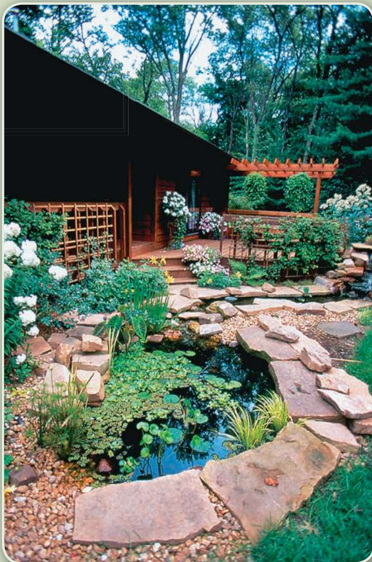
Firewise landscaping can be both effective and attractive. This pond beautifies the lawn and provides additional fire protection.

This publication is available from county UW-Extension offices, Cooperative Extension Publications – 1-877-947-7827, and from DNR Service Centers.