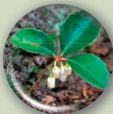
Wintergreen Gaultheria procumbens

A low, woody ground cover with shiny dark green leaves that turn reddish with the advent of cold weather. Small bell-shaped white to pink flowers are produced from June to August, followed by red berries in the fall that may persist through the winter. This leathery perennial has creeping underground stems, thus forming small colonies of plants.