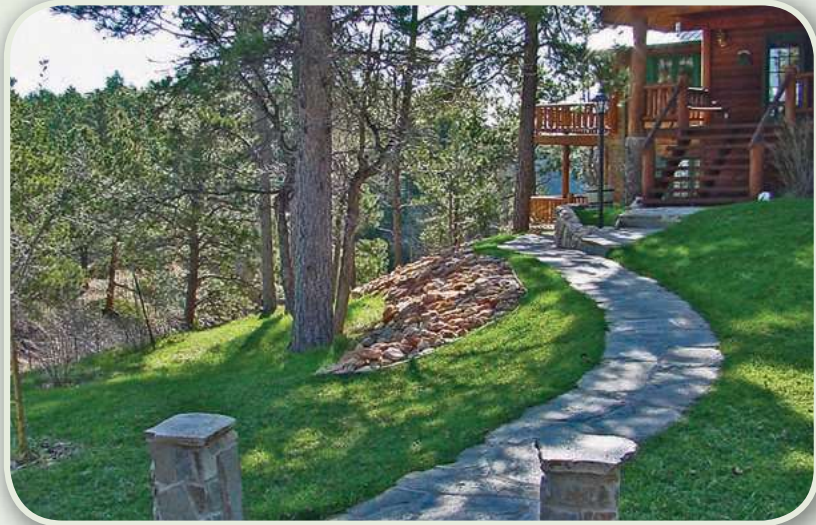
Fire burns faster uphill, making the removal of vegetation farther out essential to slow the fire down.

MAKE SURE YOUR DRIVEWAY IS AT LEAST 12 FEET WIDE WITH A VERTICAL CLEARANCE OF 14 FEET FOR FIRE DEPARTMENT VEHICLE ACCESS.