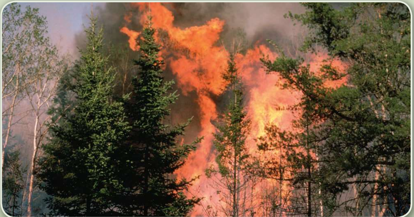
A crown fire in the tree canopy.

“...HAVING UNDEVELOPED WOODLANDS AND FIELDS IN AND AROUND A NEIGHBORHOOD MEANS THAT RESIDENTS SHOULD KNOW HOW TO PREPARE THEIR HOMES...”