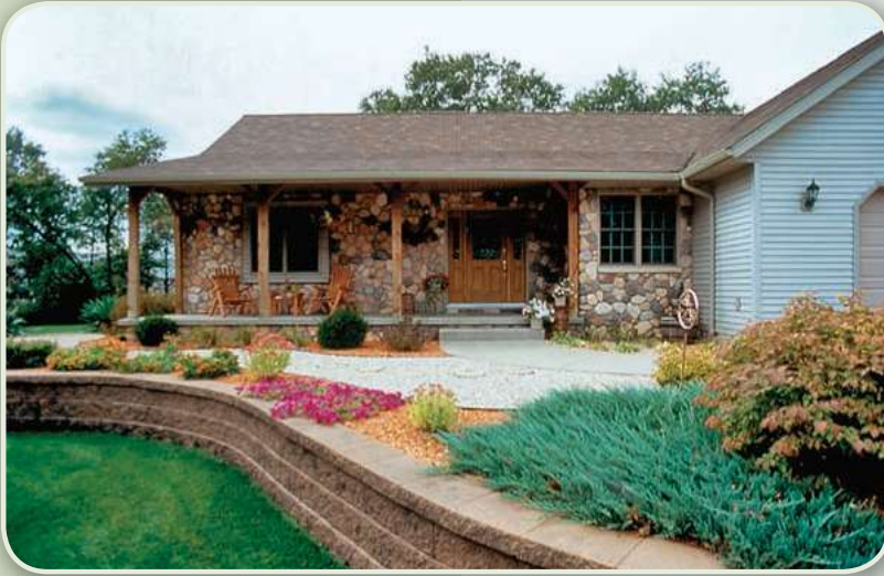
This raised garden bed is an attractive, low-maintenance, and fire-resistant landscaping choice.