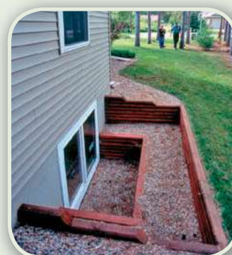
A 3-to-5-foot "fuel free zone" keeps flames away from siding.

Moving farther away from the house, landscape trees, shrubs and plants should be managed to ensure that any fire in this area remains on the ground and burns quickly (i.e. no smoldering) and with low intensity. That means keeping the lawn clean of fallen pine needles and leaves. All vegetation should be well manicured, green, and healthy.