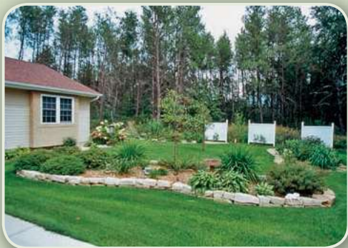
Garden "islands" keep plants isolated and away from your home's siding.