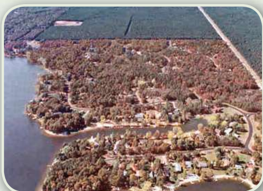
In many localities, good fire prevention requires cooperation among neighbors.

Residential developments within the wildland-urban interface often include a higher density of housing than typically found in more rural areas. In these cases, an individual's Home Ignition Zone might overlap that of a neighbor's. In these developments, if one property owner does everything possible to improve the condition of their property and the neighbor does nothing, the neighbor's fuel load might be enough to cause the loss of both homes. Talk