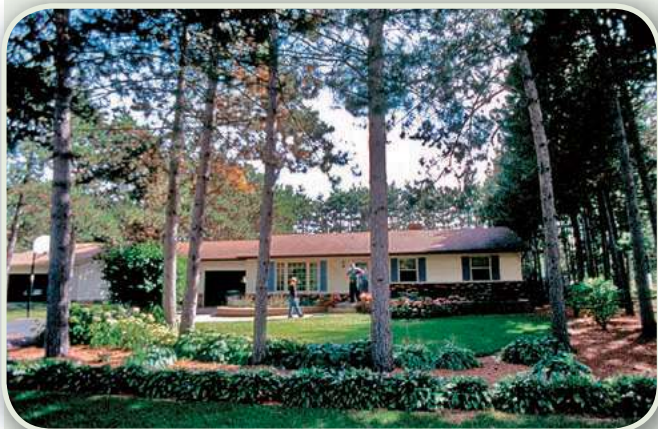
A Firewise yard in a pine forest.

Many new homeowners build within pine forests and then struggle with maintaining the aesthetic nature of the forest while protecting their homes.