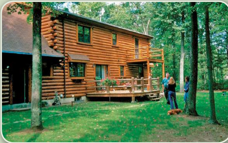
A well-managed Home Ignition Zone helps keep wildfire away.

Crown fires can catapult burning embers onto your property, including your home. Crown fires are the most destructive of all wildfires, able to kill mature trees and shrubs, and can move over large areas in short periods of time. Some surface fires, especially grass or marsh fires, can move very fast and cause great injury or even death when they are underestimated. Surface fires can become crown fires in stands where there are “ladder fuels” (i.e. branches that extend to the ground and allow a fire to climb up a tree to its crown).