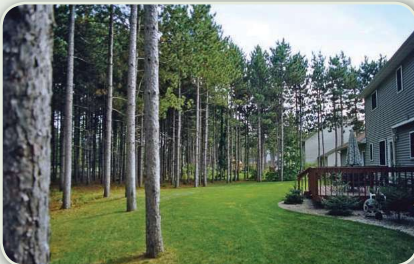
Pine trees need to be kept well spaced and pruned high.

Outside the HIZ, fire can essentially burn unabated without causing a home to ignite. However, it is important to note that most homes do not burn from high intensity fires. Most of the homes lost to wildfire in the Great Lakes region burn either from surface fires in the wake of the main fire front, or from the accumulation of windblown firebrands in advance of the fire. Simply put, Firewise landscaping and maintenance is critical.